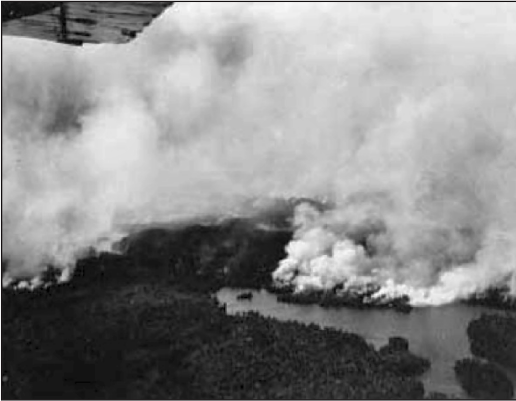
Fig. 2. This is the type of smoke-choked scene that pilots would have encountered when flying near the fire in the summer of 1948. This is an aerial photograph taken near Thessalon in 1948.

Dubreuil & Frère Engr; Dubreuil Brothers Limited (DBL). 11 Napoléon and Joachim both left their jobs with the railway in order to devote themselves completely to getting the family business up and running. The brothers vainly tried to obtain cutting rights in Québec but when this venture failed they decided that, with plenty of concessions available in northern Ontario, they would try their luck outside the province. 12