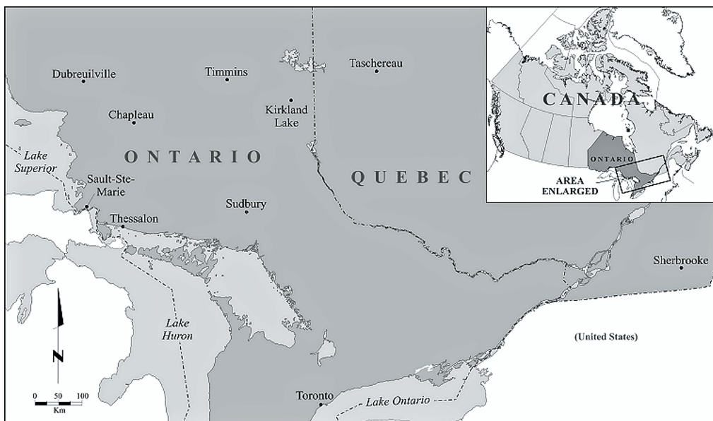
Fig. 1. Map of northern Ontario and Québec highlighting the key locations for Dubreuil Brothers Limited.