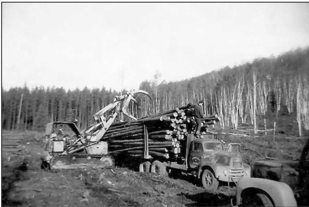
Fig. 6: Loading logs near future town of Dubreuilville, circa 1960.