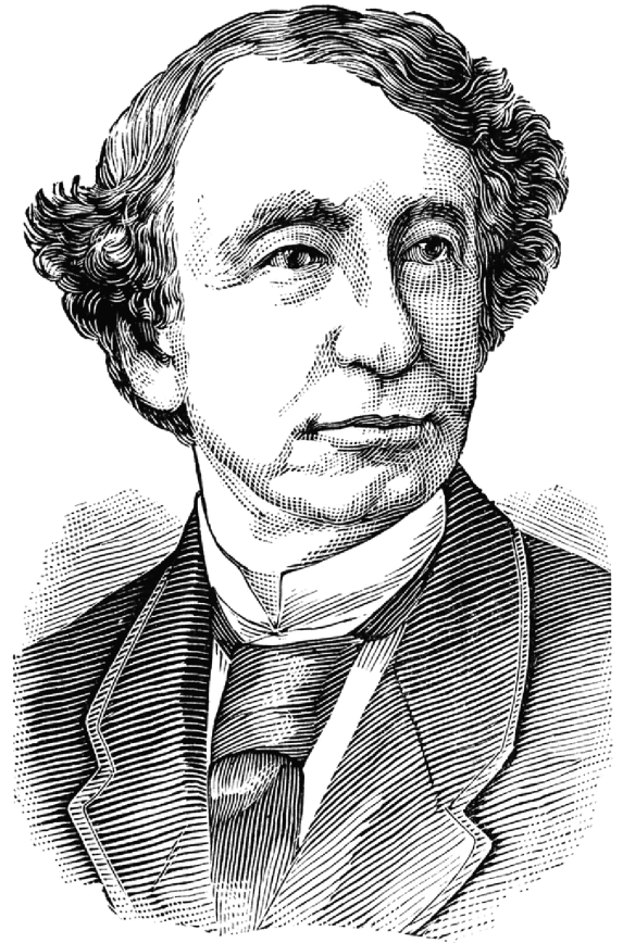
John A. Macdonald