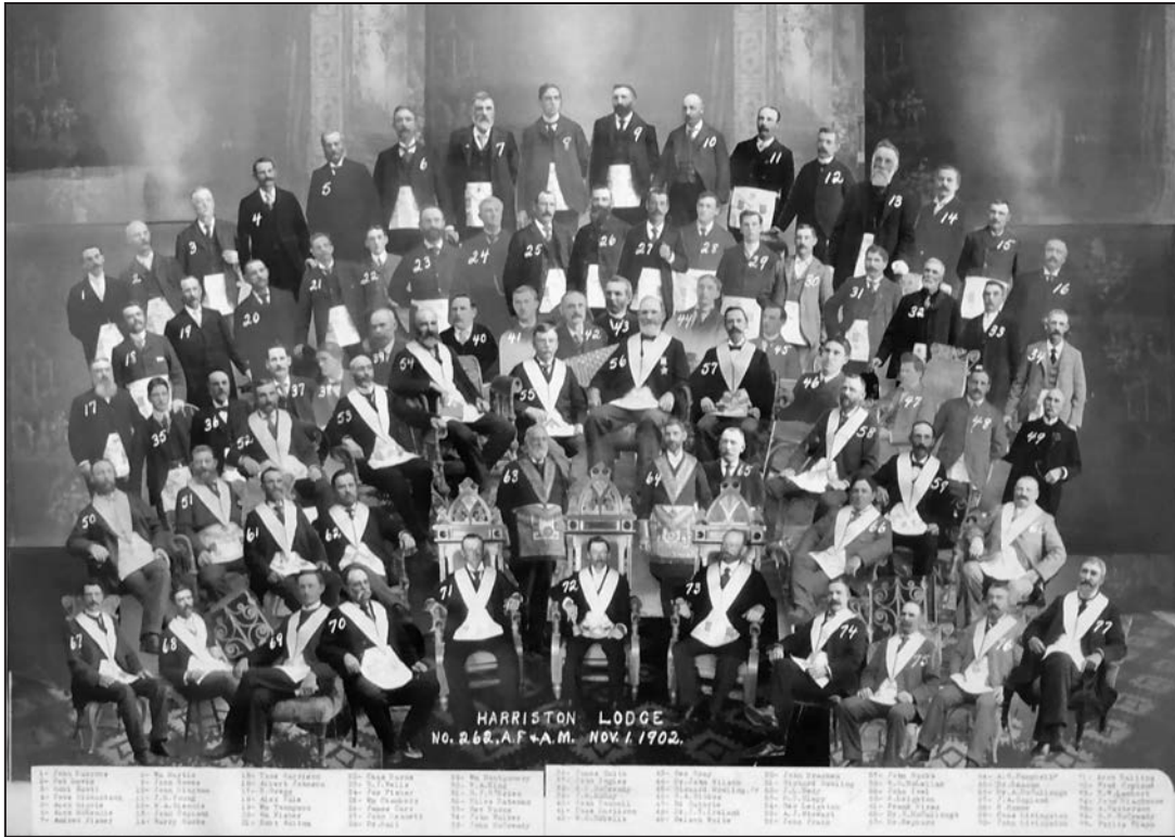
Members of AF&AM Lodge #262

be fined one dollar or any member of No. 1152 disobeying the committee on the 12th of July be fined one dollar. 43 Three years later, this fine was quintupled. 44