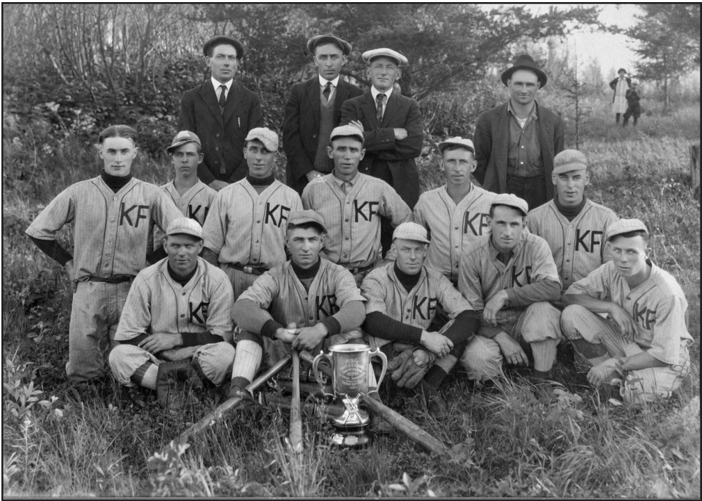
The team from Kakabeka Falls, Ontario, winners of the Rural Baseball League Championship trophy in 1913.

comradeship so yearned for by the young farmer, the absence of which often triggered a move to the city. 88