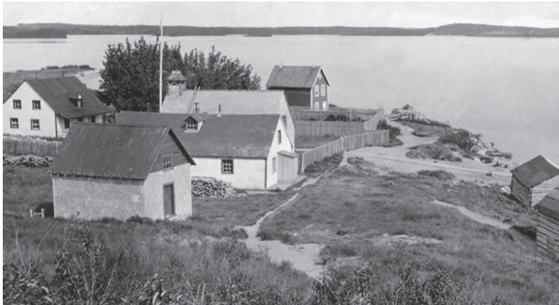
Osnaburgh House.