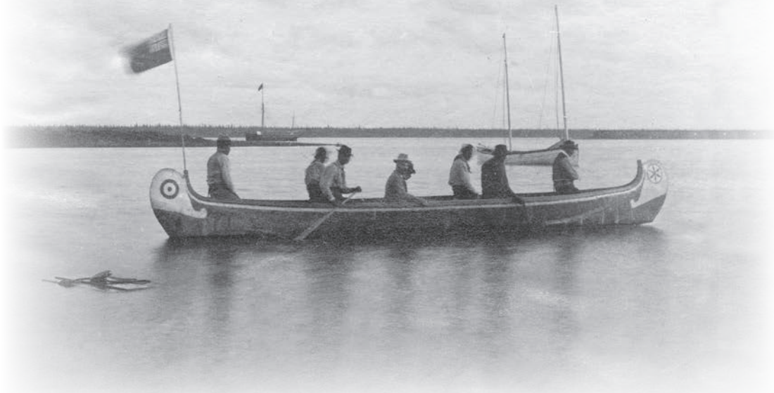
Hudson's Bay Company canoe near Herrogate House, 1894.