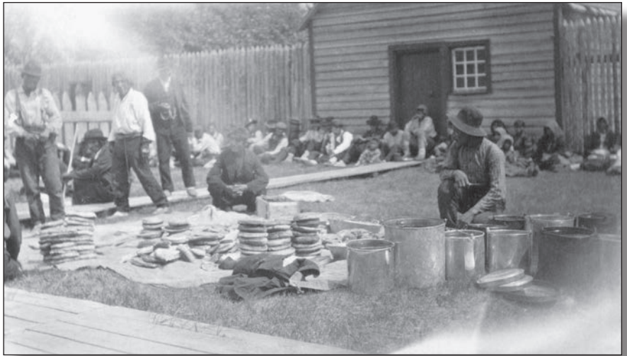
Feasts were held after every signing ceremony. Company posts made a small profit as a result. An additional fifty tons of flour was sent to HBC posts to satisfy Aboriginal demands following the distribution of treaty money, and to provide for the feasts.