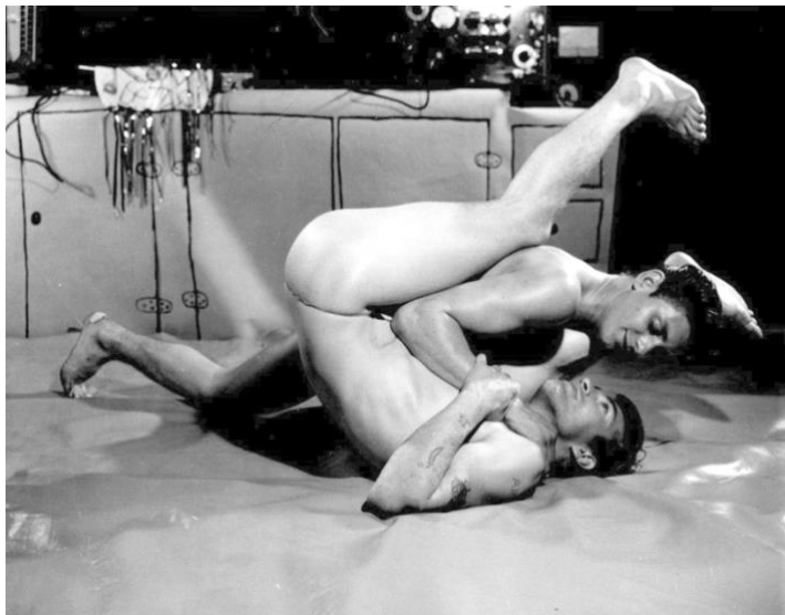
Figure 1: Still from Making of a Monster , Courtesy Bob Mizer Foundation.

Mizer's series of Frankenstein films were shot on markedly similar sets, sometimes identical. Most of the films contained at least some form of electrical machine (often with a climbing high voltage arc), a gurney or laboratory table, makeshift cabinets that on close inspection had drawn-on hinges and doors, and a mat on the floor for wrestling.