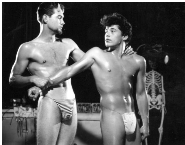
Figure 2: Still from Scientist and the Demon , Courtesy Bob Mizer Foundation.

Given this efficient production system, Mizer also needed a distribution arrangement that emphasized his product variety. He accomplished this by interspersing the release dates of films across thematic product lines (such as the Frankenstein shorts) so that similar films were not released simultaneously. The Frankenstein-line averaged a new film in release every year or two. To make customers aware of the films, Mizer