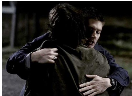
Figures 6 and 7: Sam dying in Dean's arms in "All Hell Breaks Loose (Part 1)" (2.21)