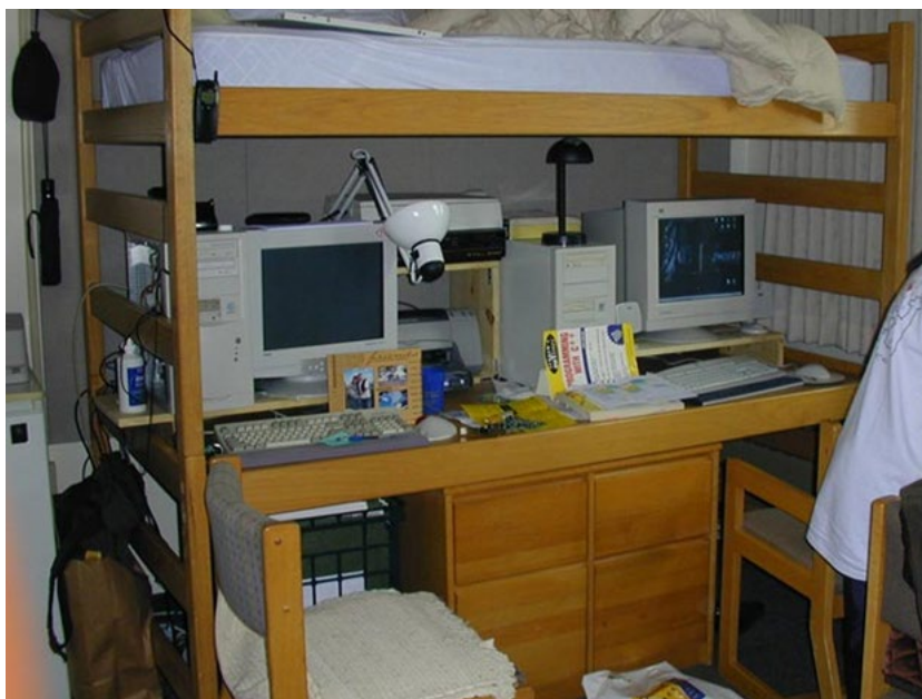
Figure 2: the "secret crunchyroll headquarters" listed on the about page of Crunchyroll, circa

NBCUniversal's Peacock and its classic comedies such as The Office (2005-2013) (NBC, 2019), Crunchyroll began its streaming platform embedded in such fan communities from the beginning. These fan communities were a key source of labour and consumption, and directly enabled Crunchyroll's compression model that shifted the anime distribution industry. Crunchyroll capitalized on the shift from consumer to "prosumer," subtly coercing anime fans who wanted to watch anime to contribute to building their site. What began as a pirated anime content provider turned into a legitimate streaming service, becoming the biggest legal anime streaming provider while other companies such as FUNimation and VIZ Media struggle to catch up. Furthermore, Crunchyroll influenced other streaming platforms to enter an increasingly competitive anime distribution market, with Amazon Prime Video, Netflix, and other SVODs offering their own exclusive series and original productions (Williams, 2019; Petit, 2021).