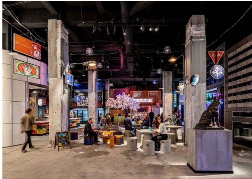
Figure 3: a photo of Crunchyroll offices listed on Crunchyroll's about page in 2020.

literally in the transformation of space, from Crunchyroll's origins in a cramped college dorm room (Fig. 2) to an expansive post-modern pastiche of Shibuya, Japan (Fig. 3). Such an expansion of space is predicated on the exploitation of labour, from unpaid fan labour during their piracy days, to Crunchyroll's current system of underpaid translators today (The Canipa Effect, 2020; 2022). Through its history of converting fan labour into industry legitimacy, Crunchyroll offers unique insight into the ways in which streaming platforms operate today.