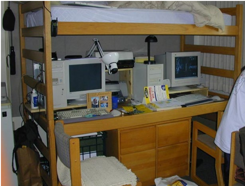
Figure 2: the "secret crunchyroll headquarters" listed on the about page of Crunchyroll, circa 2006: < https://web.archive.org/web/20060720164133/http://www.crunchyroll.com/about >