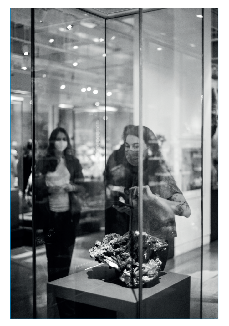
FIG. 3. AUTHOR DESCRIBING A SPECIMEN DURING THE IN-PERSON COUNTER-TOUR AT THE ROM, 2022.

On June 15, 2022, I was part of a group of researchers from the scholar-activist collective Beyond Extraction, who gathered at the Crystal to lead an unsanctioned tour of the Teck Suite (see fig. 3).<sup>27</sup> The "counter-tour" was developed as part of a growing tradition of "guerrilla tours" and other forms of activist interventions in museums.<sup>28</sup> Positing that the ROM's entanglement in corporate-extractive interests extends to the uncritical presentation of rocks, gems, and minerals in the Teck Suite and their fetishization through the architectural meta-phor of the crystal, Beyond Extraction opted to reinterpret the gallery for the public in time to coincide with, and thereby resist, PDAC's annual gathering in June 2022. Entitled "Mining at the Museum," the in-person and online counter-tour emerged as a nod to American artist Fred Wilson's 1992 "Mining the Museum," an installation wherein the artist "excavated" objects from the collection of the Maryland Historical Society to highlight the buried histories of Black Americans.<sup>29</sup> In contrast to Wilson's installation, the artifacts on display