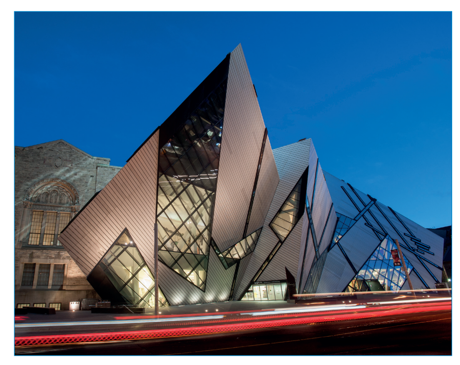
FIG. 1. EVENING VIEW OF MICHAEL LEE-CHIN CRYSTAL, BLOOR ST. ENTRANCE, APRIL 15, 2015. COURTESY OF ROM (ROYAL ONTARIO MUSEUM). TORONTO, CANADA. @ROM.

The ROM's vast collections are standard of an "encyclopedic museum," holding nearly one million objects across the realms of natural history, art, and material culture. While the museum is often noted for its impressive dinosaur skeletons or rotating blockbuster exhibitions, the crystalline minerals of the Teck Suite are what captured Libeskind's attention; leading the starchitect to make preliminary "napkin sketches" while attending