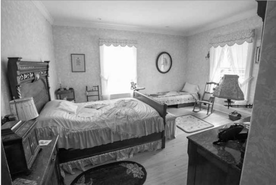
FIG. 10. WANDA WYATT'S BEDROOM UNTIL 1937. AFTER 1937—THE YEAR CECILIA WYATT PASSED AWAY—WANDA MOVED INTO THE MASTER BEDROOM OF THE HOME.