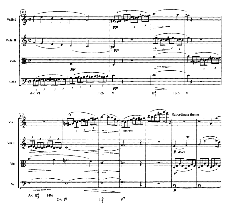
Example 6. String Quartet in A minor, D. 804, i., transition

dominant of A (bars 50-51). This gesture is immediately repeated up an octave (bars 52-53), thus suggesting a dominant preparation for a full return to A minor. When the gesture is repeated once more, though (bars 54-55), the French sixth veers to the I6 of C major, not the expected dominant of A. C is then prepared as the true subordinate key by the ensuing chord progression (I6-II6/5-V7).