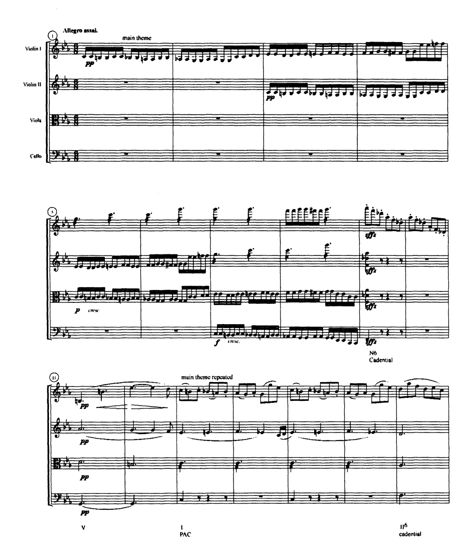
Example 8a. Quarettsatz in C minor, D. 703, main theme and transition to first subordinate theme

Neapolitan sixth. The F-G motion is reinforced in the listener's ear by the second cadence (bars 17–19), although the D-flat Neapolitan has been replaced here by a simple II6. In the third cadence, which accomplishes the transition's modulation (bars 23–27), the music returns to both the bass tone F, and the D-flat Neapolitan sixth. However the F, instead of rising to G and the dominant chord of C minor, as it has twice before, now shifts downwards to another dominant, on E-flat, as the music pivots on the D-flat sixth chord