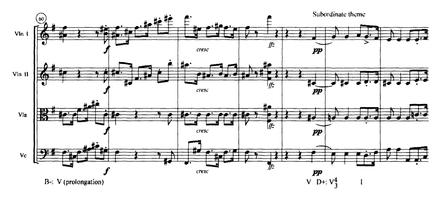
Example 4. String Quartet in G major, D. 88, i, transition l

Even when Schubert's transitions do lead to the dominant of the new key, as in Classical practice, the dominant's arrival is itself a surprise. Furthermore, this chord is not usually the goal of a half cadence—the norm of Classical transitions—but rather the penultimate harmony of a perfect authentic cadence in the new key. The focus thus does not fall on the dominant chord but on the concluding tonic of the cadence, which often elides with the beginning of the subordinate theme. Consequently, the music is not allowed to reorient itself fully before the subordinate theme begins.