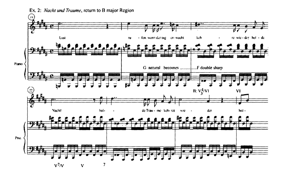
Example 2. Nacht und Träume, return to B major Region

by the fall of flat six to five. Here, though, the flat six ascends to the normal sixth degree, G-sharp (example 2, bars 20–21). This is accomplished through the enharmonic ambivalence of the A-sharp diminished seventh chord (bar 20), whose G-natural becomes F-double sharp with the conversion of the diminished seventh to the applied dominant seventh of G-sharp minor (VI) in bar 21. The rising force inherent in the altered note's new leading-tone function expresses the yearning of "Kehre wieder heil'ge Nacht! Holde Träume Kehret wieder!" (Come back, sweet night! Sweet dreams, come back!).