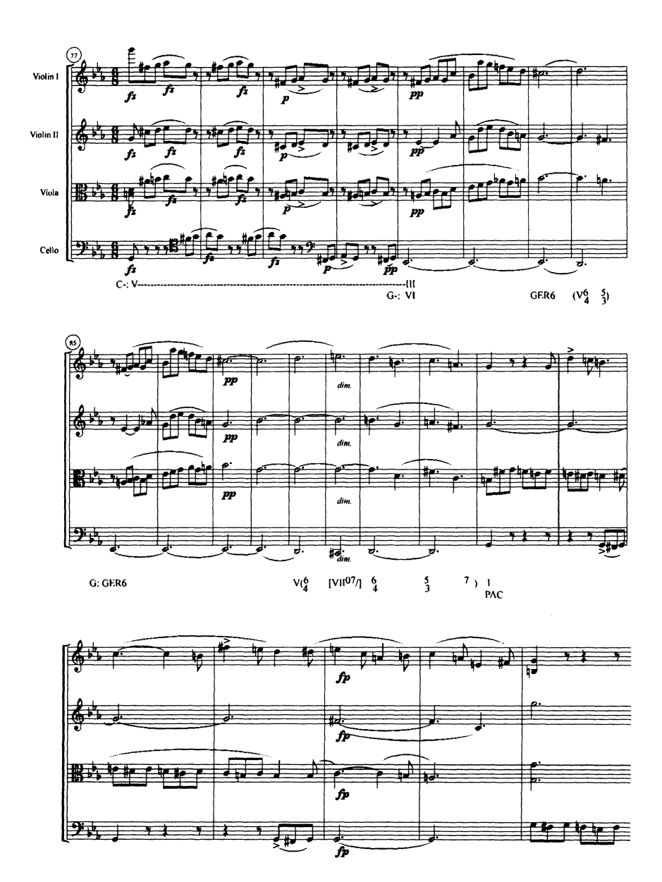
Example 9. Quarettsatz in C minor, D. 703, second transition