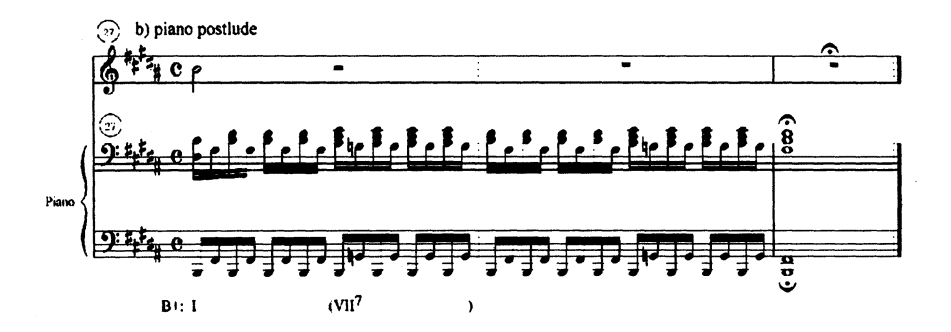
Example 3. Nacht und Träume, D. 829