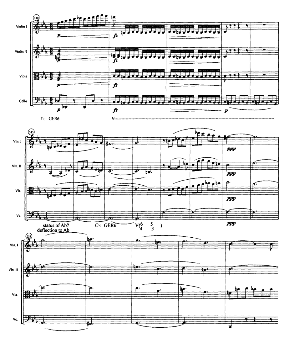
Example 12. Quarettsatz in C minor, D. 703, recapitulation, transition to second subordinate theme

stances, the array of different modulatory strategies Schubert uses allows for a subtle distinction between substantial and insubstantial states of existence, by either maintaining the otherworldly qualities of the modulation when the same theme returns later in the form, as in the unusual recapitulation of the Quartettsatz , or by contrasting that modulation with a carefully grounded, more conventional one, as in the Quartettsatz 's second subordinate theme. Furthermore Schubert thoroughly integrates the illusory modulation into the form by having its constituent harmonic elements echo across the movement. The formal consequence of this type of construction, in which the structure of the movement is dominated by a circular tonal motion that flows outwards