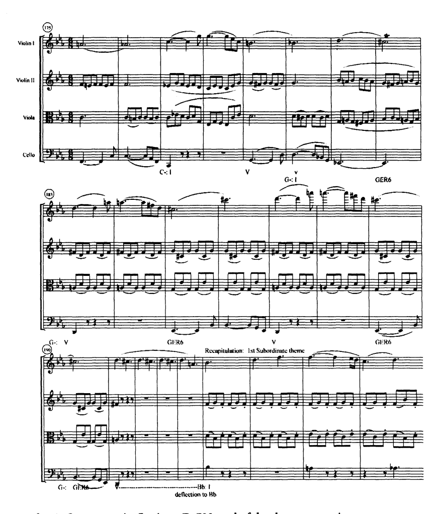
Example 10. Quarettsatz in C minor, D. 703, end of development section

music is suddenly deflected into B-flat major.<sup>28</sup> The surprising shift intensifies the dream-like quality of the theme. Shortly afterwards, the unprepared key fades into E-flat major (bars 206-7, not shown). The insubstantial nature of B-flat major—its unexpected entrance and equally unexpected dissolution—suggests the immateriality of not just a dream, but the memory of a dream. The slip into E-flat major further intensifies the sense of yearning as the melodic arch expands, while the theme itself, by never being grounded in C, remains a vision forever floating outside the tonic sphere.<sup>29</sup>