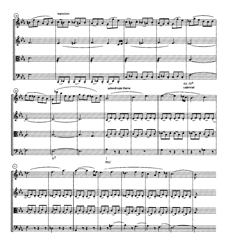
Example 8b. Quarettsatz in C minor, D. 703, main theme and transition to first subordinate theme

into a perfect authentic cadence in A-flat major. The slow harmonic rhythm at this point coupled with the wandering soprano line suggests the disorientation of someone overtaken by a vision.