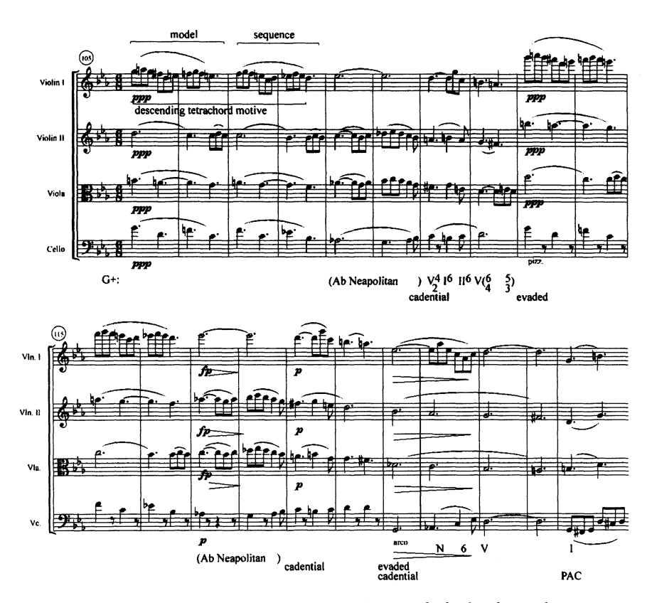
Example 11. Quarettsatz in C minor, D. 703, exposition, end of subordinate theme