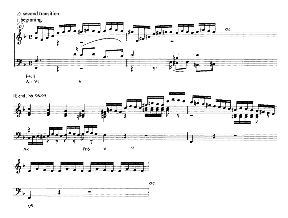
Example 7c. String Quartet in D minor, D. 810, "Death and the Maiden"

beginning of the transition as the upper portion of the E dominant ninth (bar 45). The passage preceding the entrance of the applied diminished seventh plays with the enharmonic double of the chord's A-flat, the G-sharp, which consistently embellishes the A of the F major chord (bars 52–57, violin I and II). This melodic detail is then taken up as prominent feature of the ensuing subordinate theme, where both G-sharp and B-natural work in tandem as altered neighbour tones to A and C (bars 62–63 etc.). Throughout the first subordinate theme, this neighbour-tone figure remains a purely melodic detail lending a certain A-minor colouring to the line. Latent within this figure is a VI-V harmonic motion in A minor (example 7b, ii), and it is precisely this progression that launches the modulation to A at the beginning of the second transition (example 7c). Here the G-sharp finally emerges as a true leading tone and F major loses its status as a tonic to become a subordinate harmony—the submediant—in A minor.