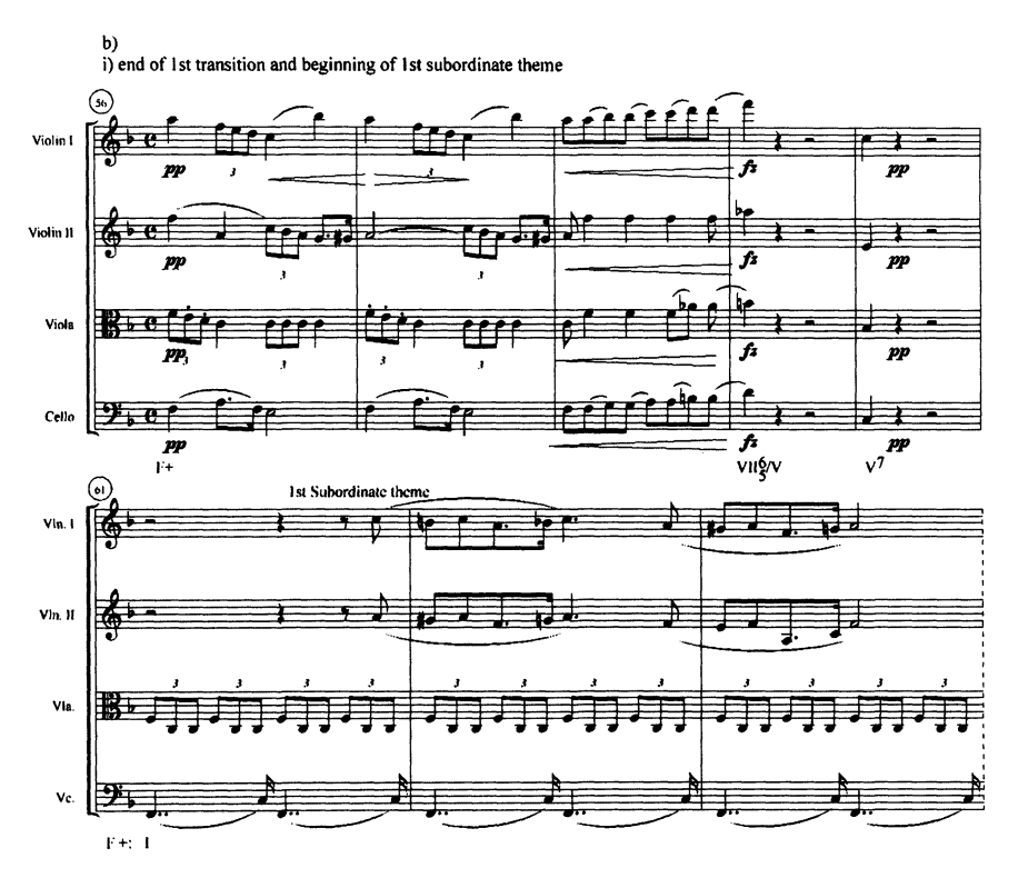
Example 7b1. String Quartet in D minor, D. 810, "Death and the Maiden"

To some extent, the transition compensates for the unusual, premature arrival of F major during its course by ending with an apparently conventional dominant preparation for the new key (example 7b, bar 60). However, rather than solidifying F major, this gesture in fact subtly undermines it. The chord preparing the new dominant seventh, the applied diminished seventh of C (bar 59), is also the diminished seventh of A minor and was heard at the