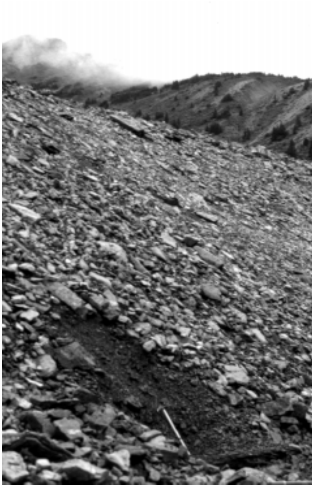
FIGURE 4. Steep frontal margin of the outermost debris complex in the Hilda Glacier forefield. The ice axe sits within our excavation and points downwards to one of the boles recovered from beneath the debris.

Marge frontale escarpée du complexe de débris le plus externe au front du glacier de Hilda. La hache repose dans un des trous creusés dans le cadre de la présente étude et pointe vers un des troncs recouverts de sous les débris.