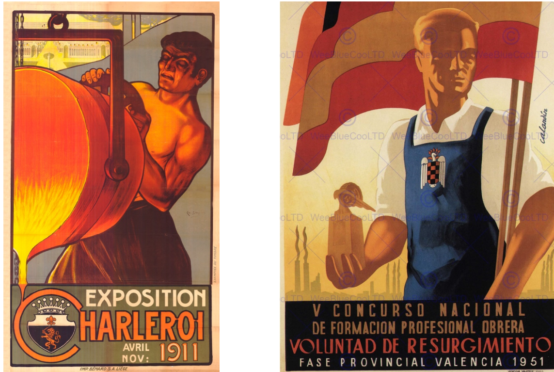
Image 1: Advertisements of the exhibition held in Charleroi in 1911 and of the National Competition for Vocational Training for Workers held in Valencia in 1951. Sources: https://bit.ly/3b9Ksm7 and https://bit.ly/2WkibFv .