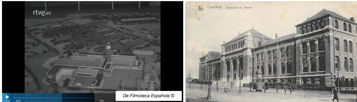
Image 3: Model of the José Antonio Primo de Rivera Labor University (Seville) and main facade of the Belgian UT. Source: Noticiario n. ° 695A (30/04/1956) and Postcard retrieved from https://www.geneanet.org/cartes-postales/view/7696651#0 .

NO-DO was a faithful reflection of these great buildings that would house the Spanish Labor Universities. Although the Belgian UT never appeared, the great similarities can be appreciated in image 3 (buildings) and image 4 (workshops).