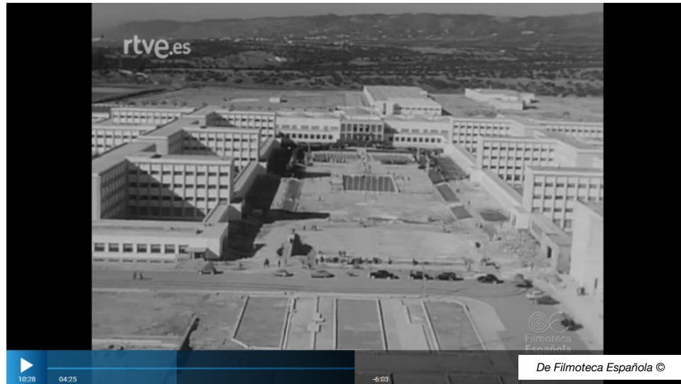
Image 5: Onésimo Redondo Labor University (Córdoba).

year it hosted just 560 students, although this number increased to 1,370 five years after its opening. The Labor University of Zaragoza had a capacity for 4,000 students, although in its first year only 650 boys were enrolled (Noticiero n. ° 724B, 19/11/1956).