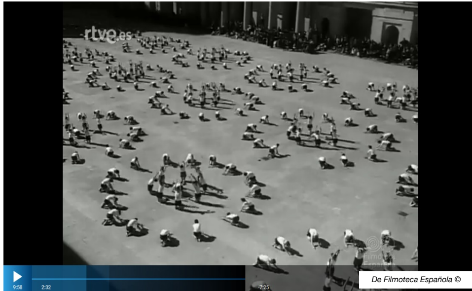
Image 6: Students from the José Antonio Girón Labor University of Gijón performing a gymnastic exhibition.

The LUs had classrooms, housing for apprentices, workshops, sports fields (see Image 6), a dining hall, rest and study rooms and other facilities “appropriate to the size of this project” (Noticiario n. ° 526A, 02/02/1953). It is evident that the size and layout of these buildings were made to convey emotions, to impress; chapels, halls, theatres, courtyards were spectacular, impressive. In short, huge and magnificent buildings that, in addition to housing impressive workshops, machinery and facilities (Delgado-Granados and Ramírez Macías, 2017), conveyed the feeling of grandeur, of power, where the future worker could feel small in this macro-institution (see Image 7), but at the same time each they could feel part of the “Francoist revolutionary action in favor of the Spanish, and in which the worker would be” the active subject of the entire social revolution ”(Delgado-Granados and Ramírez Macías, 2017, p. 128 ). Currently, most of these buildings have been restored and host educational or cultural institutions (image 8).