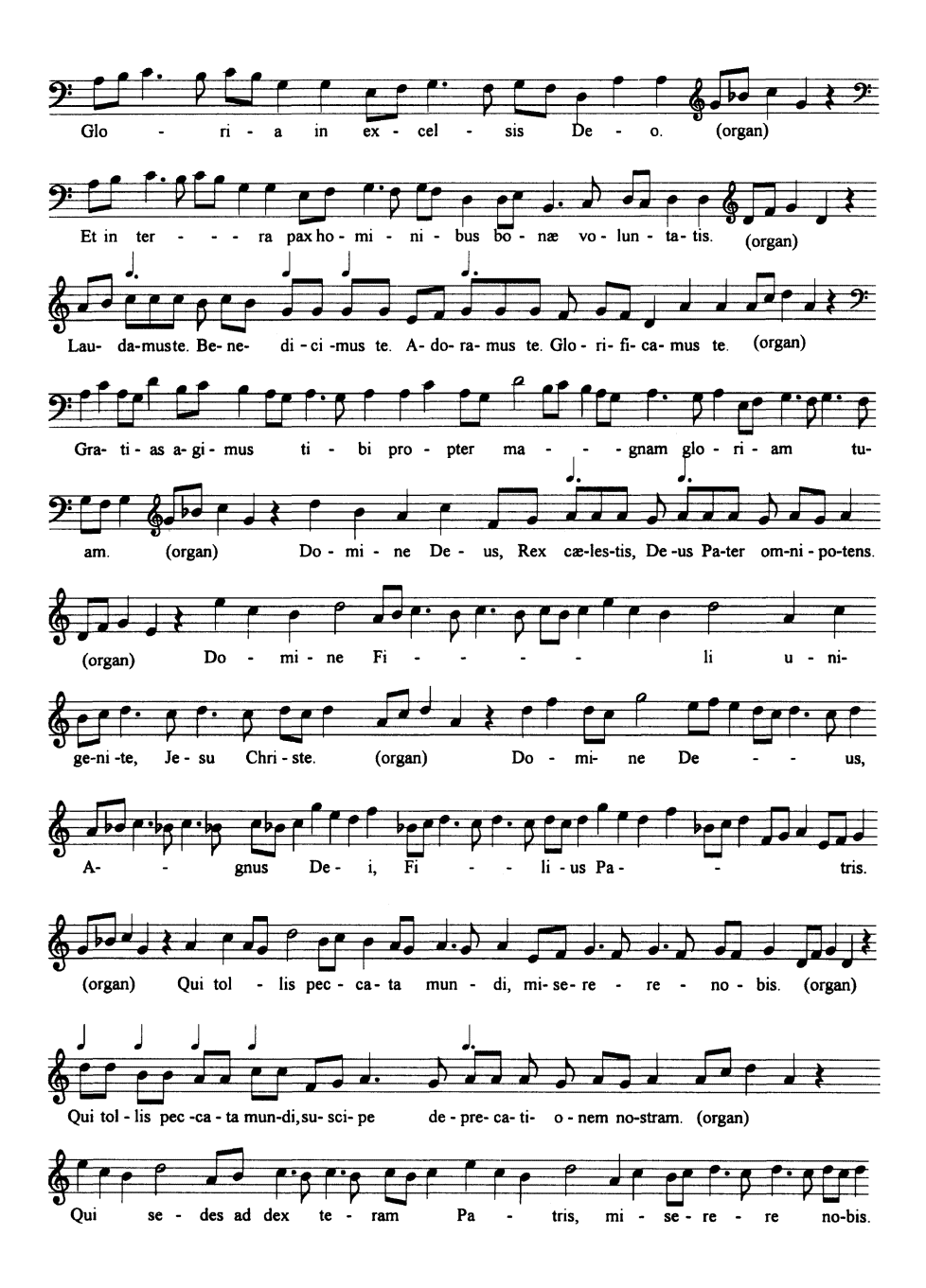
Example 1: Prélude with Gloria text (melodic line only)