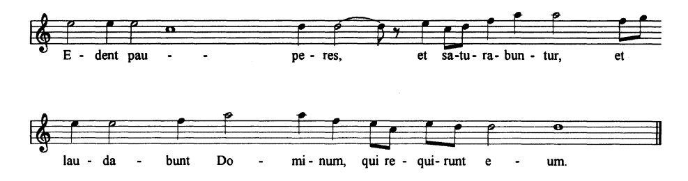
Example 3: "Chant ecclésiastique" with added text (melodic line only)

For the first harmonization of the "Prière pour les voyageurs," a short petition from the office of Our Lady, Mediatrix of all Graces<sup>26</sup> seems to be a match for Satie's musical "prière," for it speaks of succour and deliverance by the glorious Virgin: