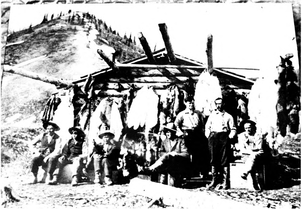
Figure 2. Old Crow Village, ca. 1915.

number of total births, restricted to women who have completed the reproductive period of the life-cycle (between the ages of 15-49; Barclay, 1958). The second component is that of mortality ( I_m ), given as: