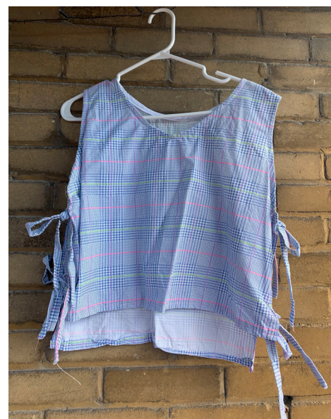
Figure 3. An example of Adrian's sewing; she says that making her own clothing is a fun and challenging way to express herself while also developing a practical skillset.