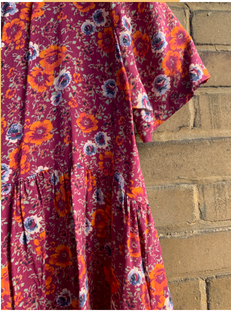
Figure 4. An example of Adrian's sewing where she uses second hand fabric to try and keep the environmental impact as low as possible.

Using the categories revealed through the focused round of coding, I went through the interview transcripts once again highlighting where these categories emerged. From this round of coding, I observed that the most prominent category for Adrian was 'leisure.' For example, Adrian noted that "for sewing it's more like when I'm in search of a project and I need something to keep me busy for a couple of days". For Julia, it was 'control' as she noted that "I kind of want to get into sewing, and if I get good at it, the thought of being able to make most of my own clothes is so cool."