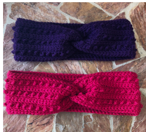
Figure 2. An example of Julia's crochet work; winter headbands that she made because she wanted to buy, but she realized she could make them herself instead.