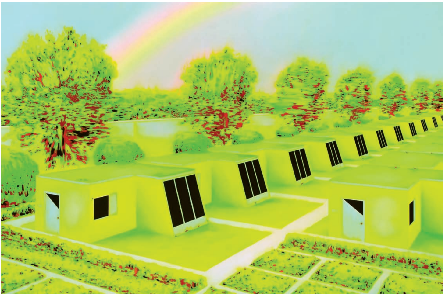
Nicolas Grenier, Inclusive Gated Community .

It is, of course, consummately strange that Grenier’s ‘architectures for work and inhabitation’ remind us of the non-places that the French anthropologist and theorist Marc Augé developed in his seminal book Non-Places: Introduction to an Anthropology of Supermodernity , 2 —after all, these are places for human dwelling rather than the vast portable parentheses of the airport or ATM machine precincts. Not so strange if we understand that it is precisely because they register a potent thematic of estrangement built up from bifurcated tropes of the built world and nature that requires deconstruction on our part as viewers complicit in the making of meaning. And all the windows and doors are closed. We are looking at blueprints ostensibly built upon utopian signifiers that are in fact harbingers of the apocalypse: humans under total control. Architectural eugenics. But while human agents are conspicuous by their absence in many of these paintings, we project them—ourselves—in there, and with