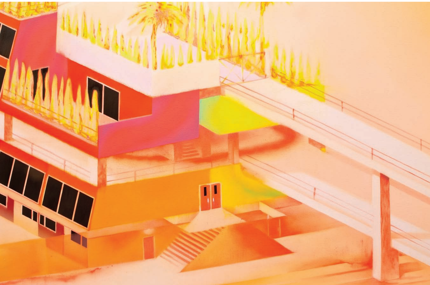
Nicolas Grenier, Vertically Integrated Socialism (Detail).