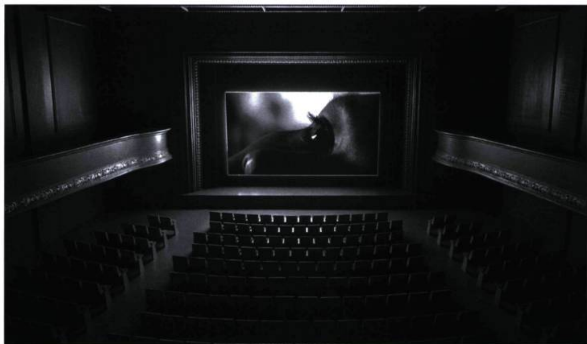
Janet Cardiff & George Bures Miller, The Paradise Institute , 2001. Canadian Pavilion, 49 th Venice Biennial.