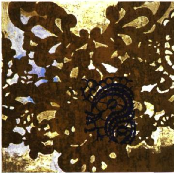
Harlan Johnson, Festoon 10 , 2000. Acrylic on canvas, 71 x 71 cm.

F estoon, an exhibition of Harlan Johnson's recent paintings was held at Galerie Trois Points in Montréal in the autumn of 2000. The gallery is located on the fifth floor of the Belgo building above Sainte-Catherine Street. Thus to visit the exhibition one had to traverse an active retail thoroughfare with its advertising panels and shop windows of electronic displays. Approaching the building that houses the gallery, one walked by a plethora of digitally reproduced imagery, through a visual environment of multiple copies. Walter Benjamin's effect of technological reproduction always comes to mind in these vibrant commercial settings, where the aura of any original idea has been watered down through endless processes of duplication.