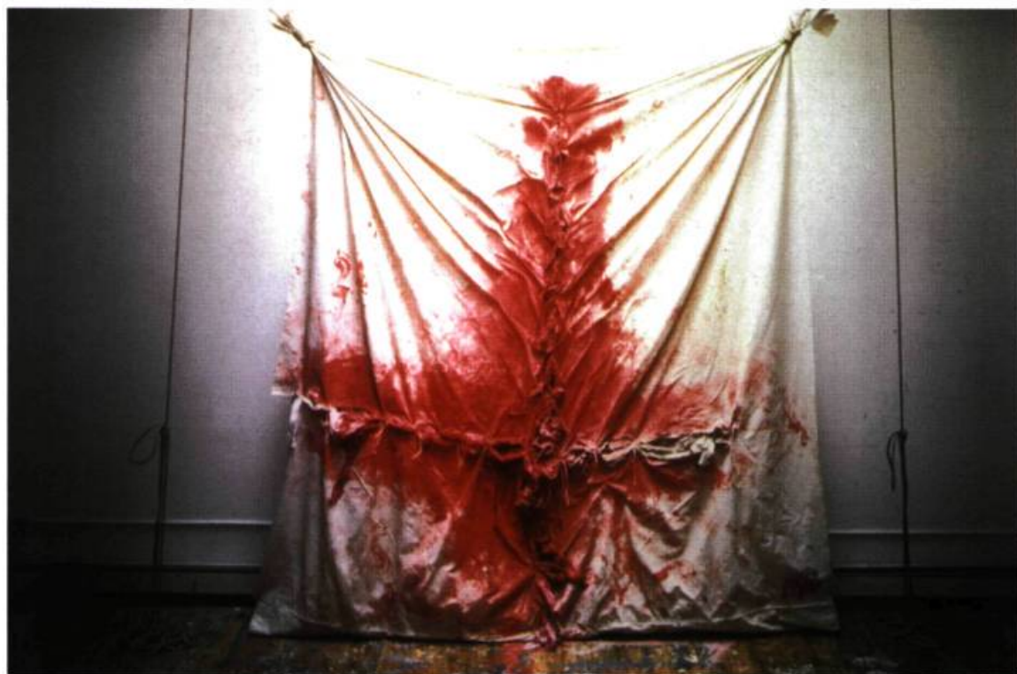
Cosimo Cavallaro, Birth # 6 , 364 x 455 cm.

Cosimo Cavallaro, No England/No Amsterdam II , Real Art Ways Gallery, Hartford (Connecticut). May 17 - July 6, 1997