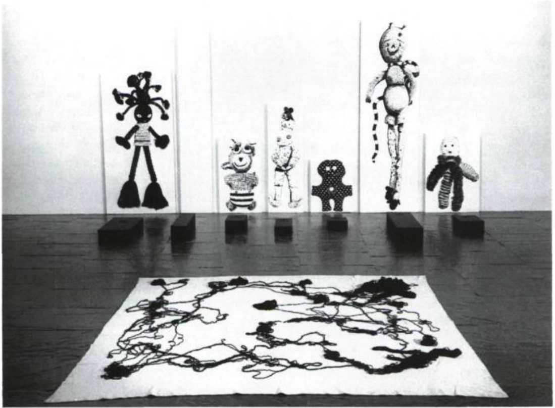
Mike Kelley, Empathy Displacement : Humanoid Morphology (2 nd and 3 rd Remove) , 1990 ; Acrylic on panels, handmade stuffed dolls in wood boxes.

floor), at least six gay or lesbian artists and seven artists of color or from ethnic minorities.