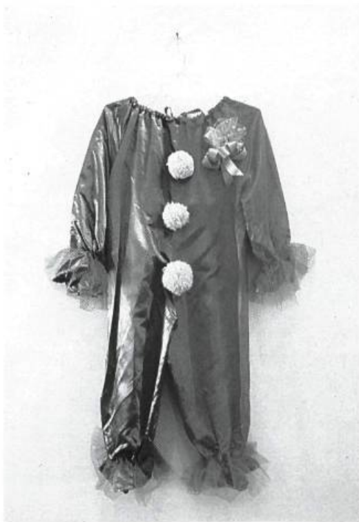
Polly Apfelbaum, Princess , 1990. Cloth, flowers ; 38" x 24". Amy Lipton Gallery.

The ambivalent ebb and flow continues in Drown The Clowns , an installation of three clown suits tacked to the wall in ascending order of size, from the smallest, Princess , to the largest, A Penny for a Star . Sort of a nu-