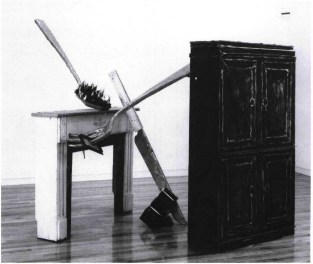
Bill Woodrow, Empty Grate , 1987. Wood, aluminium duct, enamel and acrylic; 81 x 86 x 80 in.

becomes a kind of litany. Burden also notes if the submarine is nuclear powered and one effect of the piece is to make us more aware of the missile-laden vessels constantly moving around under the ocean and the polar ice-caps, ready at a moment's notice to unleash their destructive missiles. Burden addressed this subject in his 1981 piece, Reasons for the Neutron Bomb in which he used coins and matchsticks to represent the 50,000 Russian tanks which the neutron bomb was supposed to protect us against. Although its subject and means were unorthodox, All the Submarines of the United States of America accomplished one of the chief tasks of art, to make the unseen visible, and it did so with a mixture of fascination and fearfulness that was just as memorable, and a good deal more interesting, than Burden's earlier gunplay.