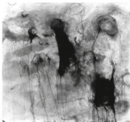
Sylvia Safdie, Goreme No. 9 , 1987. Mixed media on paper.