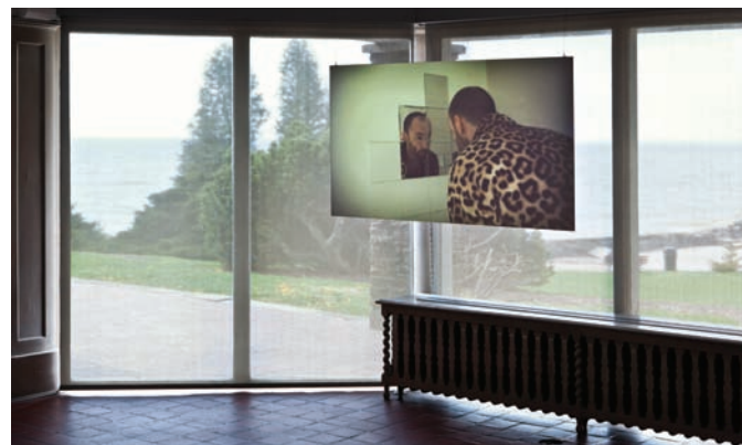
Exhibition view, Keren Cytter: Based on a True Story , Oakville Galleries in Gairloch Gardens, Oakville, 2012.