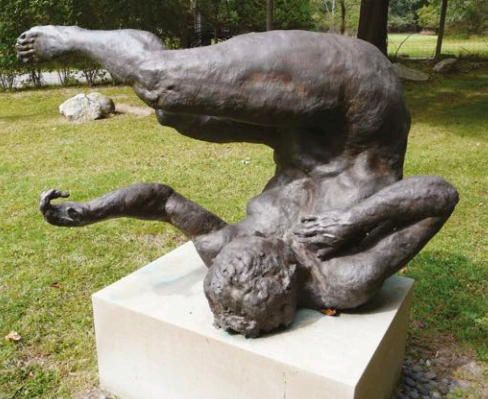
Eric Fischl , Tumbling Woman , 2002. Bronze, Edition of 5 with 3 APs, 94 x 188 x 127 cm.