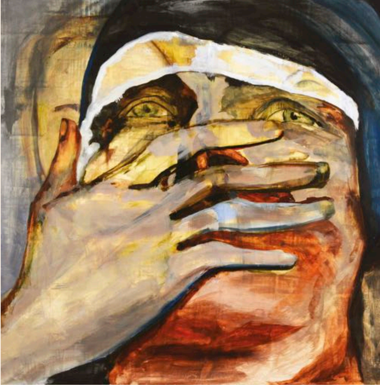
Emily Falencki , Loretta , 2014. Oil on traditional gesso on plywood, 61 x 61.1 cm.

fueled by the cancers of racism, misogyny, and civil strife that seem to be the inescapable symptoms of our wounded age. The images she gleans from the media, and recreates as her own images, are not of victims or chance or accident, but of human design.