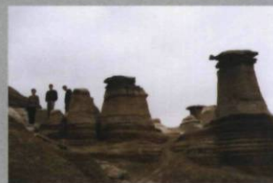
Jin-Me Yoon Rocky Mountain Bus Tour , 1991 From the Souvenirs of the Self series Chromogenic print 10 x 15 cm