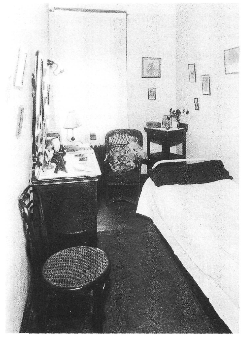
Room at Y.W.C.A. n.d.

proposed that each local association "compile and keep up-to-date a list of certified rooming and boarding houses for the benefit of girls arriving in strange cities." Householders, wishing to let rooms, were encouraged to contact the YWCA. Each room would be carefully investigated and the unsuitable ones weeded out. Any houses suspected of being unclean or not respectable were banned. In this way the girls could be sure of the kind of house they were entering. 15