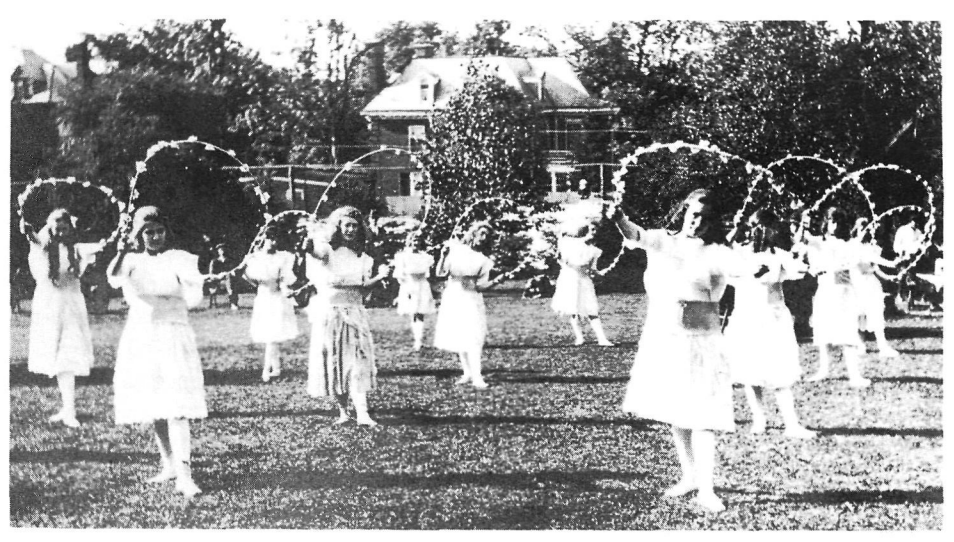
Hamilton YWCA Garden Feta, 1920.

First bell at six o'clock, when everybody must leave the dormitory not to return until bedtime. As to that hour, it came at