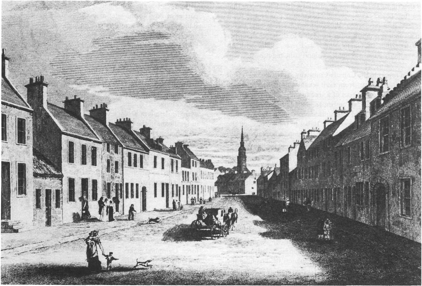
FIGURE 2. The Town of Irvine in Galt's time. Engraving by H. Lizars.