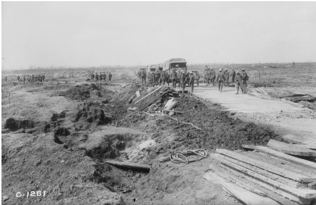
Figure 5. Laying a road over the crest of Vimy Ridge. April, 1917.

Another labour-intensive nonhuman actor in the transportation network was the bridge. Prewar field engineering manuals emphasized infantry foot bridges, pontoon bridges, and expedient crib and wooden truss bridges for heavier loads. 27 Prewar, there was no prefabricated bridge designs or components. Battle experience during rapid advances in March 1917, at Vimy Ridge and Passchendaele, lent urgency to the need for prefabricated bridges as well as more information about bridging. A British