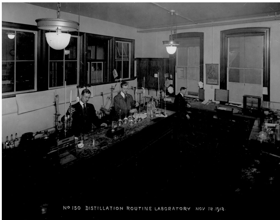
Figure 4. Distillation Routine Laboratory, British Acetones Toronto Limited, Department of Militia and Defence supplementary photograph collections, Vol. 68, No. 150, Library and Archives Canada (LAC).

of fermentation” had been installed (Fig. 4). As Speakman later describes, “It was only by going back to the earlier, more successful work in the laboratory, carried out under properly controlled conditions, that sound principles were formulated to guide the work in Toronto.” The IMB invested a further $1 million into refitting the plant with equipment capable of using the Weizmann process to convert grain into acetone. 43 By the following year, British Acetone had produced almost the entire quantity of acetone across the Entente nations. The dramatic uptake in this synthetic solvent resolved further issues with the British and Canadian supply for explosives manufacture, which had been affected by the disruption of the Entente’s trade networks.