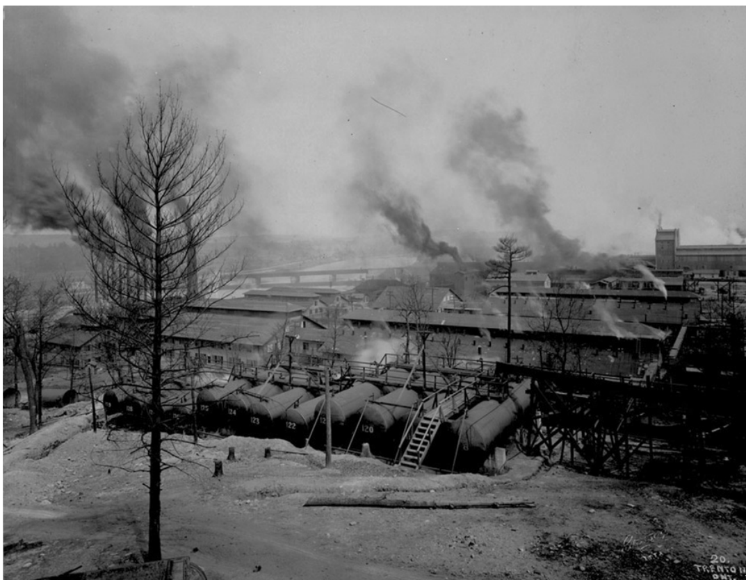
Figure 2. General view of Guncotton Lines, British Chemical Co. Ltd., Trenton, Ontario.

1917, Trenton residents were ordered to evacuate their homes as explosions continued through the night. The IMB's Chairman Sir Joseph Flavelle described how the townspeople "took to the roads, some travelling as far as Brighton, some to Pembroke, some out in the country among the farms, some fell by the wayside exhausted and were later picked up by automobiles and carriages sent from the town. I believe the state of panic was almost indescribable." Eight members of staff received the Order of the British Empire for continuing at their post during the incident, including the first Canadian woman to receive the honour, Switchboard Operator Eva Curtis. 3