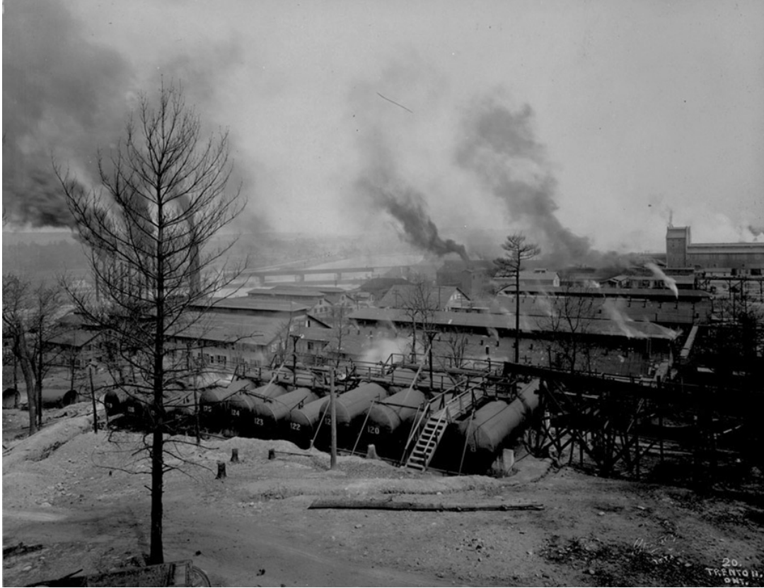
Figure 2. General view of Guncotton Lines, British Chemical Co. Ltd., Trenton, Ontario.

1917, Trenton residents were ordered to evacuate their homes as explosions continued through the night. The IMB's Chairman Sir Joseph Flavelle described how the townspeople "took to the roads, some travelling as far as Brighton, some to Pembroke, some out in the country among the farms, some fell by the wayside exhausted and were later picked up by automobiles and carriages sent from the town. I believe the state of panic was almost indescribable." Eight members of staff received the Order of the British Empire for continuing at their post during the incident, including the first Canadian woman to receive the honour, Switchboard Operator Eva Curtis. 3