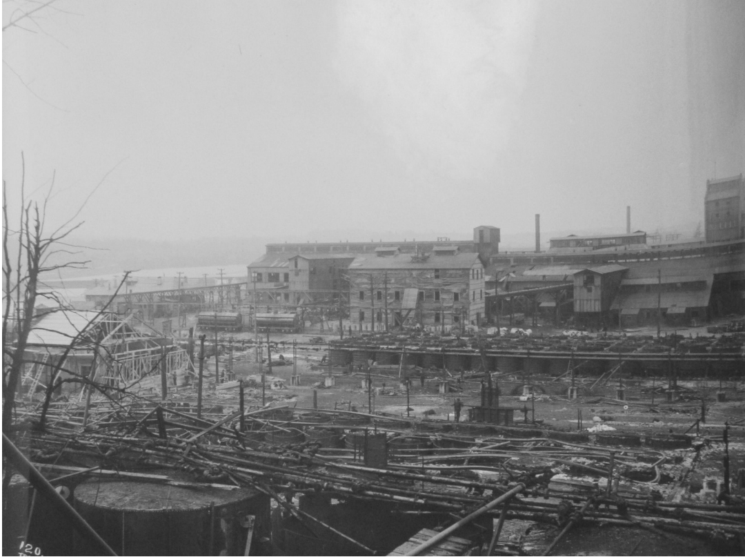
Figure 1. Explosion and Fire at Trenton (with photos), 1918-1919, Vol. 42, File 4, MG30-A16, Library and Archives Canada (LAC).

per day, was closed for the Thanksgiving holiday weekend. Only seven of the operators were working and the boarding houses were mostly empty. Over 400 patients diagnosed with influenza were resting in the main hospital, but like the boarding houses, these were located on the far side of the grounds and separated from the chemical plants. A report conducted by the IMB's Explosives Department on-scene foreman indicated that one of the TNT nitrators began acting unusual before bursting into flames. The nitrous fumes created volatile explosive salts on contact with the surrounding metal surfaces. Some of the workers attempted to extinguish the fire. The foreman activated the plant's siren before travelling first to the TNT office, where he could not get an outside connection, and then to the administration building to contact the Explosives Department and the local police service. On his way back, he met up with one of the site's chemists, the general manager, and the captain of the military guard. That is when the explosions started, the first of the bright flashes began, and fragments of steel and burning timber scattered into the sky.