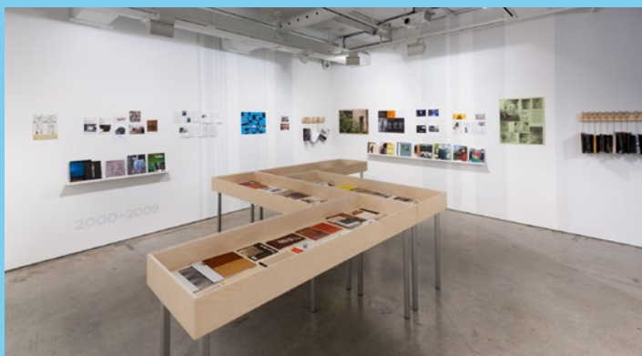
Blackity (exhibition view), Artex, Montreal, 2021.

The lines, like the exhibition overall, hold in place this wonderful assemblage of images, texts and artworks, against the ephemeral-ity (the "blips in time") of Black artists' visibility in Canadian art and criticism worlds, and towards the creation of another archive to stand with the scores of archives, mostly "little 'a' archives," that exist on websites, in gallery and community centre basements, in magazines and books and libraries, in people's memories and stories. 1 Together these materials form a bold tradition of making, performing, talking and writing about Black diasporic and Black Canadian art over the last fifty years. The tradition is multifarious, multi- and intergenerational, collaborative, and engaged with Indigenous art and art by other