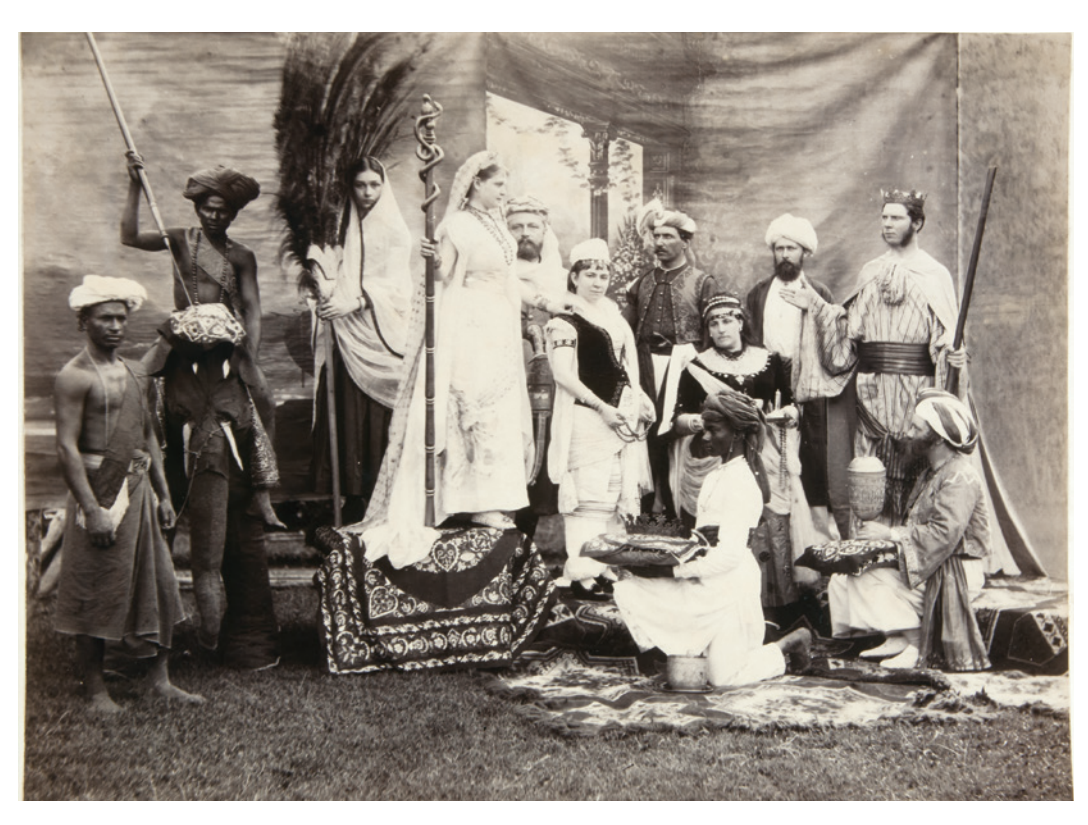
Figure 4. Unknown photographer, Tableau vivant, presumably Queen Victoria with her colonial subjects, ca. 1898. Gelatin silver print, 18.8 × 25 cm. Collection Nationaal Museum van Wereldculturen, Amsterdam. Coll.no. TM-60025539.