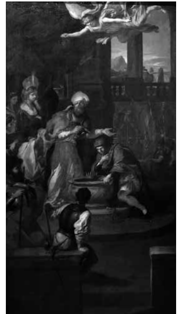
Figure 12 (below). Pierre Puget, The Baptism of Clovis I , 1652. Oil on canvas, 158 × 87 cm. Marseille, Musée des Beaux-Arts.