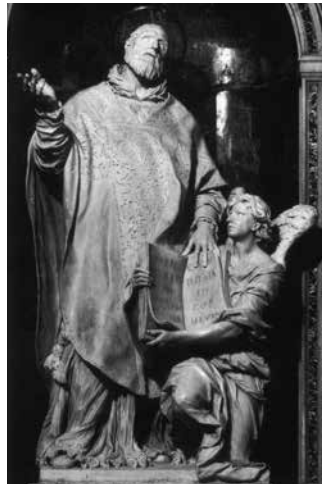
Figure 11. Alessandro Algardi, St. Philip Neri, 1636–38. Marble, c. 300 cm. Rome, S. Maria in Vallicella.