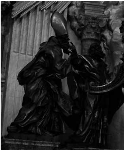
Figure 10. Gianlorenzo Bernini, St. Ambrose and St. Athanasius , detail of the Cathedra Petri , 1656–66. Gilt bronze, over-life-sized. Vatican City, St. Peter's Basilica.