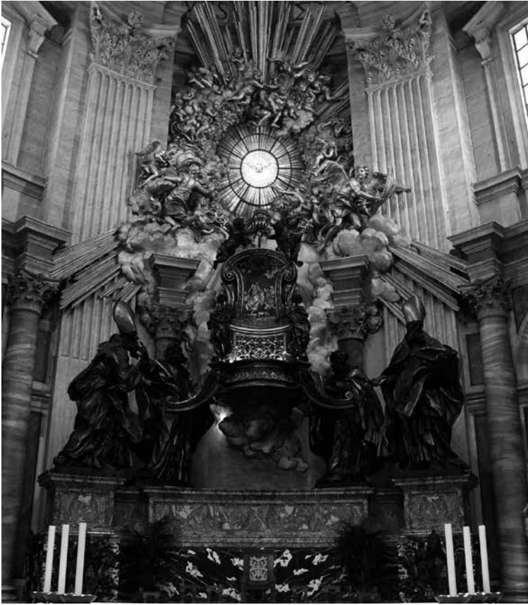
Figure 9. Gianlorenzo Bernini, Cathedra Petri , 1656–66. Gilt bronze, marble, stucco, glass. Vatican City, St. Peter's Basilica.