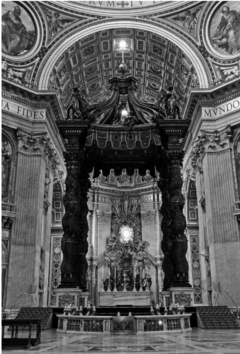
Figure 14. Gianlorenzo Bernini, Baldacchino , 1624–33. Bronze with gilded highlights, 29 m. Vatican City, St. Peter's Basilica .