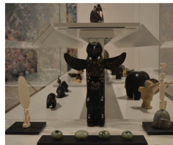
Installation shot, Canadian and Indigenous Art: From Time Immemorial to 1967, 2017, National Gallery of Canada.

For Canadians and visitors alike, NGC plays a role in defining the officially embraced national story of Canada. Bringing Inuit art out of the basement thus represents a step towards challenging settler notions