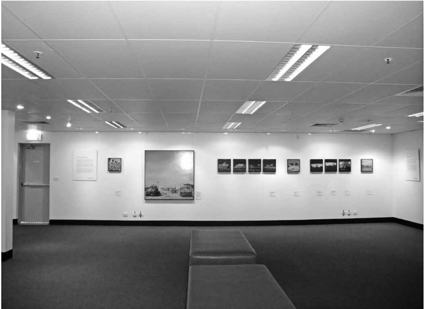
Figure 2. Installation photograph of Framing Conflict , Fleet Air Arm Museum, Nowra, 2009.

(fig. 2). 12 A sign reading “Art Gallery” was taped to the door leading to the exhibition, temporarily demarcating the materials in the room as distinct from those found elsewhere in the museum. The need to separate the works produced by Brown and Green from the war artefacts preserved by the institution echoed, in part, the desire to situate their pieces as “art.”