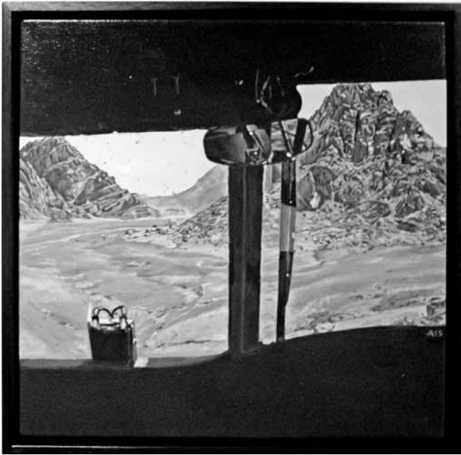
Figure 1. Lyndell Brown and Charles Green, View from Chinook, Helmand Province, Afghanistan , 2007. Oil on linen, 31 x 31 cm. Fleet Air Arm Museum, Nowra, Australia. Collection of Lyndell Brown and Charles Green. Courtesy of the artists and the Australian War Memorial (Photo: author).

focusing on different factors that contributed to the ways in which Brown and Green chose to represent Australia's military efforts. As we shall see, while the images they produced are always respectful of the military personnel they encountered, the two artists break with tradition by showing the activities of war as mundane rather than monumental. Furthermore, they problematize official conflict narratives by connecting military intervention to globalization impulses and uneven capitalist development. In this way, the paintings record Australia's participation in current war events, while simultaneously disrupting the expected national/ist history. 4