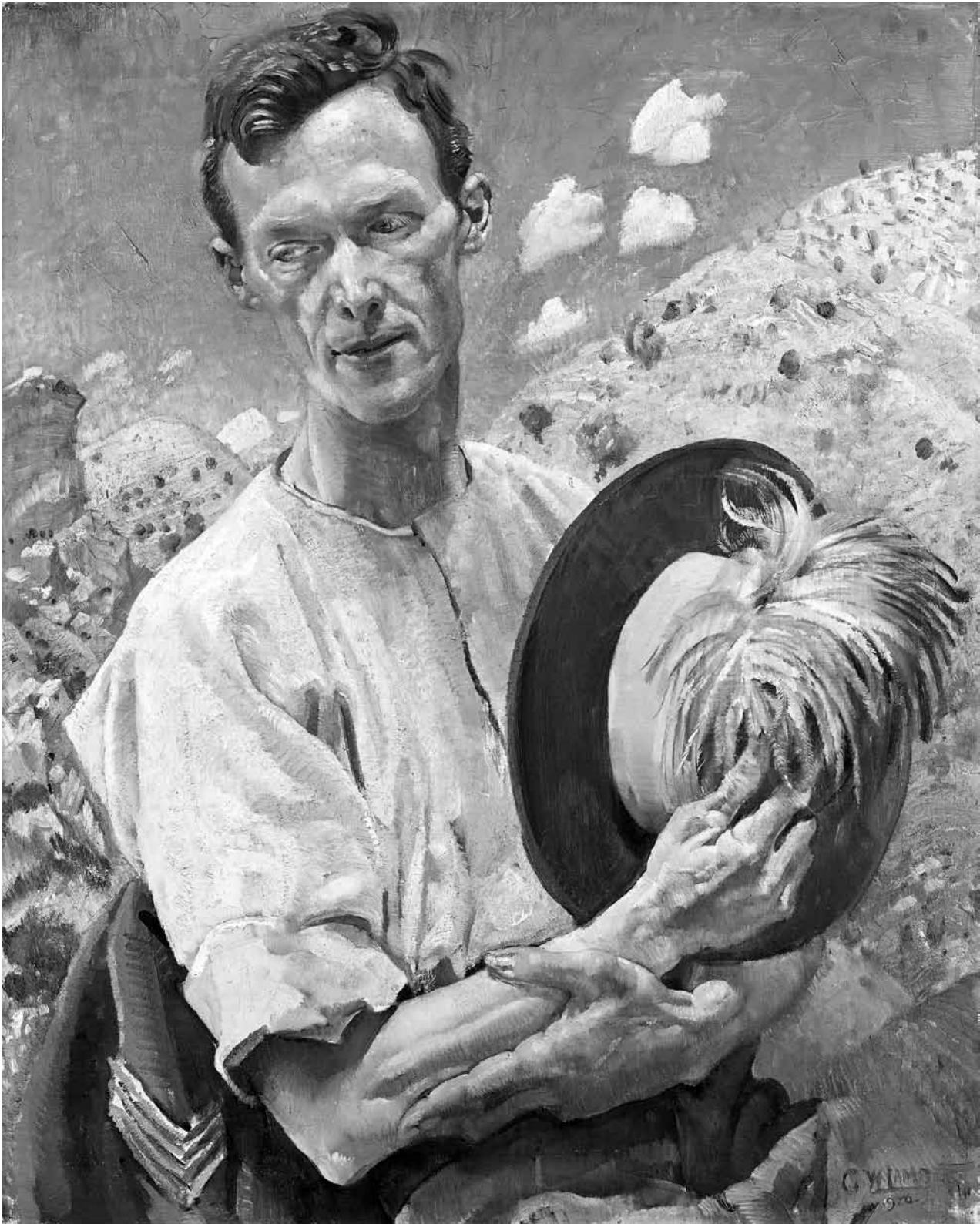
Figure 4. George W. Lambert, A Sergeant of the Light Horse , 1920. Oil on canvas, 77 x 62 cm. National Gallery of Victoria, Melbourne, Australia. Collection of the National Gallery of Victoria, Melbourne, Felton Bequest, 1921.