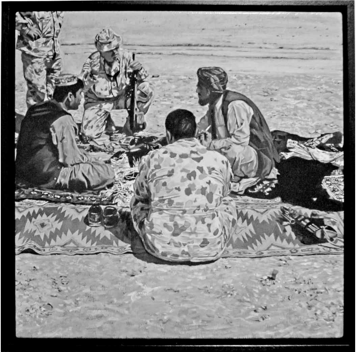
Figure 5. Lyndell Brown and Charles Green, Market Camp Holland, Tarin Kowt, Uruzgan Province, Afghanistan , 2007. Oil on linen, 31 x 31 cm. Fleet Air Arm Museum, Nowra, Australia. Collection of Lyndell Brown and Charles Green. Courtesy of the artists and the Australian War Memorial (Photo: author).