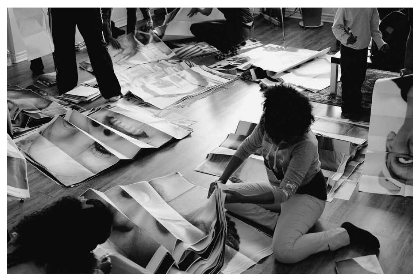
Figure 2. Photo documentation of the Toronto Inside Out group action by Manifesto Festival of Community and Culture, September 2011. Toronto, Ontario (Photo: Anna Keenan, Manifesto Festival, 2011).

mounted in their selected sites (fig. 2).<sup>25</sup> At this stage the groups have the task of mounting the posters with or without consent. Groups hoping to paste the posters with consent need to apply for permits in advance or otherwise negotiate with landholders, such as business owners, institutions, or urban developers, to obtain the rights to use the selected space. In addition, many groups plan celebratory events and engage with the press as a way to further spread the message of their project. Thus, there are wide-ranging opportunities for participation within an Inside Out group action, from having one's photograph taken to rather sophisticated, professional tasks, including the management of the action's execution.