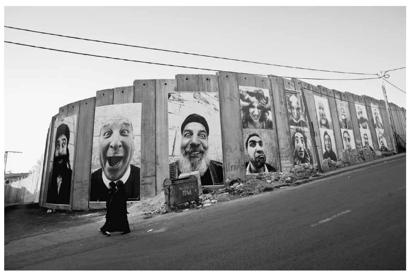
Figure I. JR, 28 Millimeters, Face2Face, Separation Wall, Palestinian Side in Bethlehem, March 2007 (Photo: JR, 2007).

developments in participatory art, visual research, and social media. Many leading scholars in participatory and collective art practices have related the rise of cultures of participation to the spread of global neoliberalism.<sup>19</sup> For example, art scholar Grant Kester suggests that we consider the recent surge of art practices that visualize social networks or produce new forms of social interactions in terms of what it reveals about our current political moment,<sup>20</sup> noting that the past two decades have not only seen the "rise of a powerful neoliberal economic order," but also a reinvigorated sense of "political renewal" in communities worldwide.<sup>21</sup> These are the conditions in which Inside Out flourishes.