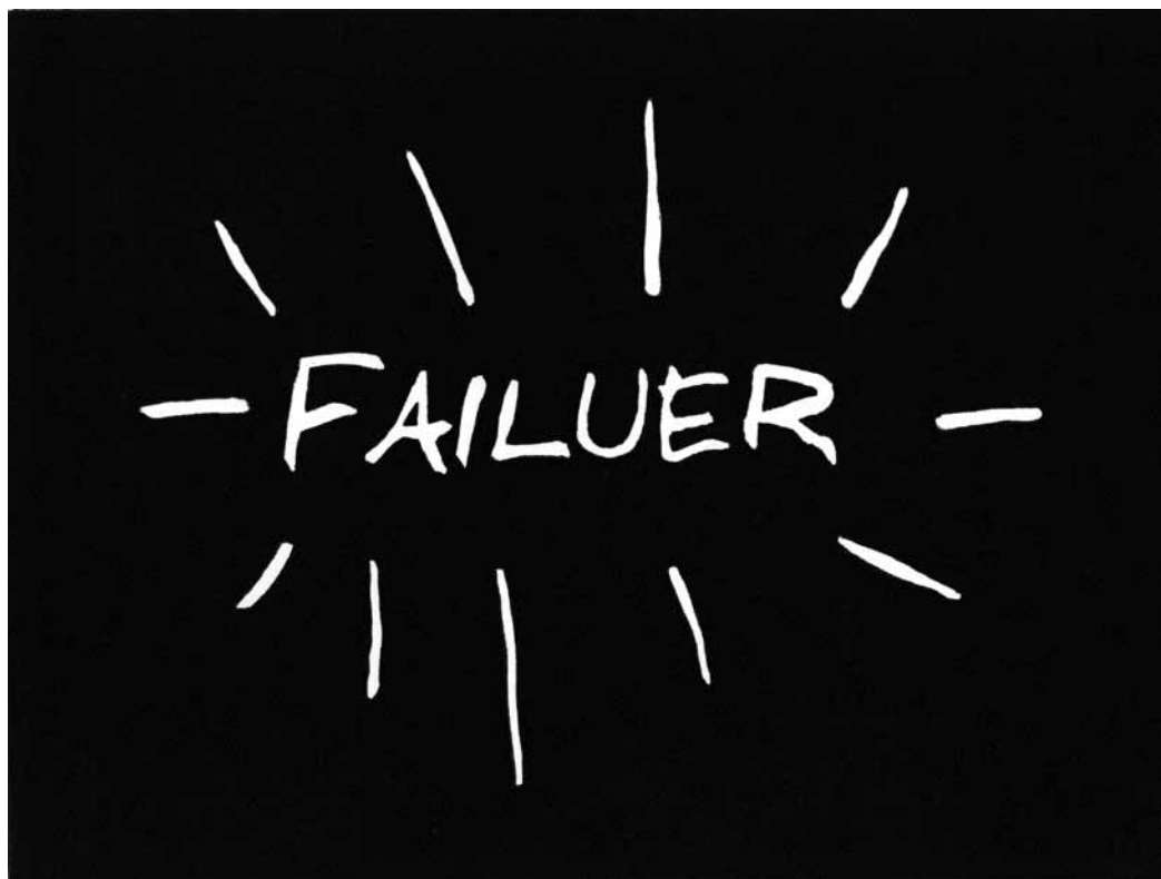
Failuer . Lino cut print, 26x35cm, 2013. Limited edition print (process blue typesetters' ink on Arches 88 paper). The work speaks to the impossibility of fully explaining or articulating the creative process. As a Canadian work of art, it also fails in both official languages.

Making and thinking are coterminous, integrating both critical and creative processes.