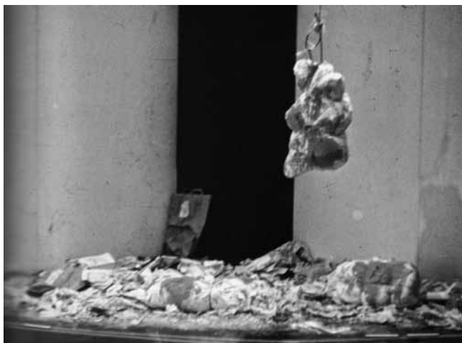
Figure 3. Artur Barrio, Situação... ORHHH... 5.000... T.E... EM... N.Y... City... 1969 ( Situation... ORHHH... 5,000... B.B... IN... N.Y... City... 1969 ), 1969. Installation view at Museu de Arte Moderna-Rio de Janeiro. Paper bag with newspapers, aluminum foil, bag of cement, garbage. São Paulo, Galeria Millan.

provoked the military police, who, after demanding and receiving confirmation that the bundles belonged to the museum, nonetheless destroyed them. A more explicit exploration of the relationship between art and landscape can be seen in Territórios ( Territories ), a pioneering work executed by Luciano Gusmão, Dilton Araújo, and Lotus Lobo. For this initial version of the piece, which they originally wanted to perform in the museum's sculpture garden, the artists placed plastic, acrylic, and aluminum sheets in the vegetation of the Aterro do Flamengo, Rio's largest park. The wind was so strong that the work was destroyed. 26 I will return to Territórios below; here one need only note how it exemplifies a more explicit dialogue with emergent "post-studio" practices such as land art in much the same manner as Barrio's Situação series.