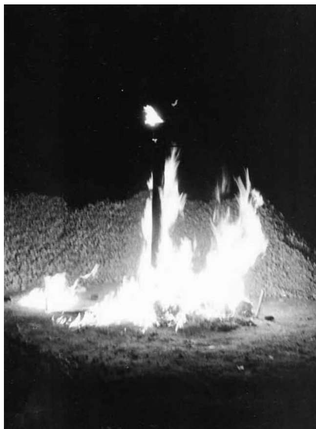
Figure 4. Cildo Meireles, Tiradentes: Totem-Monumento ao Preso Político ( Tiradentes: Totem-Monument to the Political Prisoner ), 1970. Wooden pole, white cloth, thermometer, ten live chickens, gasoline, fire.

Do Corpo à Terra ( From Body to Earth ), an outdoor exhibition held on 17–21 April 1970 in Belo Horizonte, incorporated the formal vocabulary introduced in the Salão da Bússola with the surrounding landscape. Concurrent with Objeto e Participação ( Object and Participation ), a group exhibition organized by Mari'Stella Tristão at Belo Horizonte's newly inaugurated Palácio das Artes, Do Corpo à Terra was organized by Frederico Moraes at the nearby Parque Municipal. It presented both a radicalization of the phenomenological experiments exhibited by Manuel and Meireles in the Salão da Bússola and a fulfillment of the unrealized potential of Territórios for land art. Indeed, as the exhibition's title made clear, landscape intervention and corporeal performance were ultimately linked in Do Corpo à Terra .