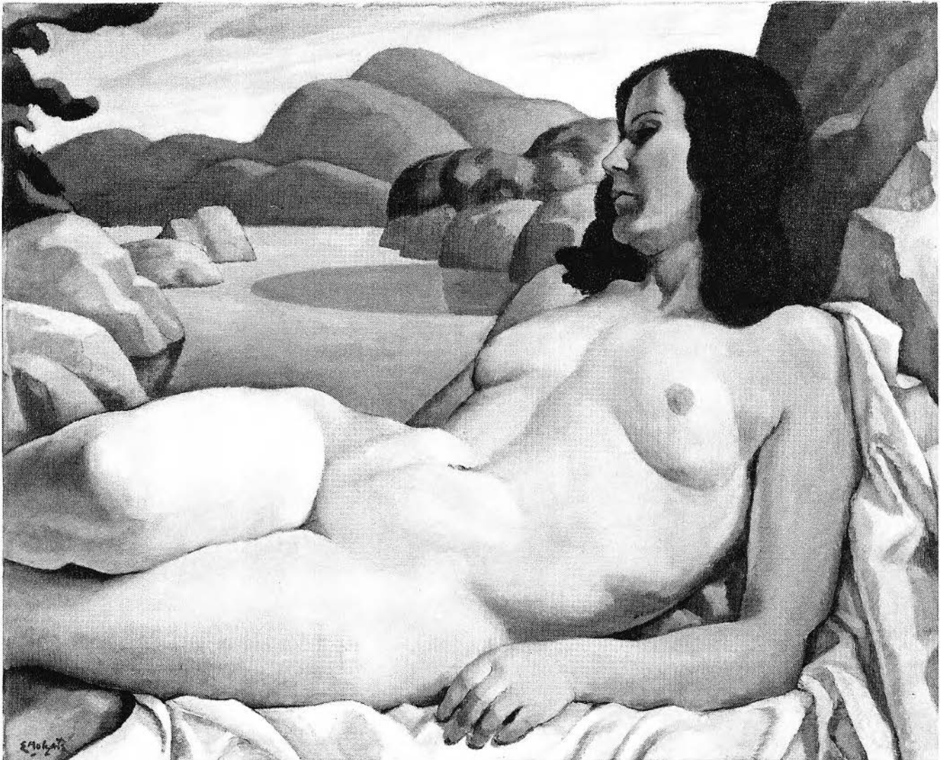
Figure 2. Edwin Holgate, Nude in a Landscape , ca. 1930. Oil on canvas, 73.1 x 92.3 cm, Ottawa, National Gallery of Canada, (Photo: National Gallery of Canada).

of black female sexuality as beyond “natural” limits. The represented black body is not within nature but separated from it. “Black Woman” is constructed as sexual spectacle for the white viewer.