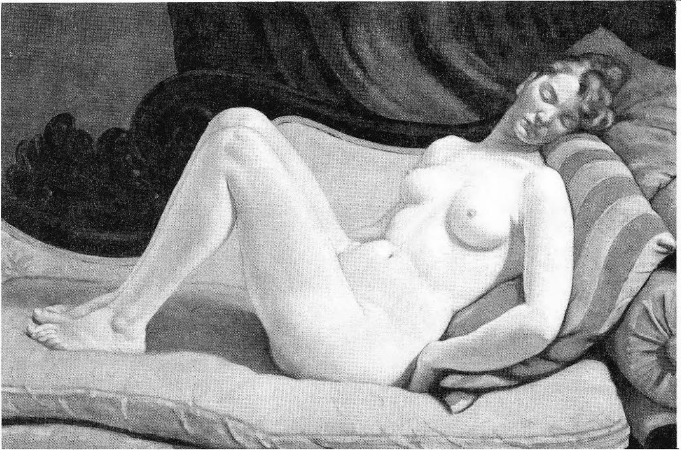
Figure 3. Randolph Hewton, Sleeping Woman , ca. 1929. Oil on canvas, 102.0 x 153.0 cm. Ottawa, National Gallery of Canada, (Photo: National Gallery of Canada).

tended to black women, still trapped within slavery or the slave reality. Thus, white bourgeois women represented passive sensuality that enabled the male gaze as it preserved female virtue and innocence for the white woman.