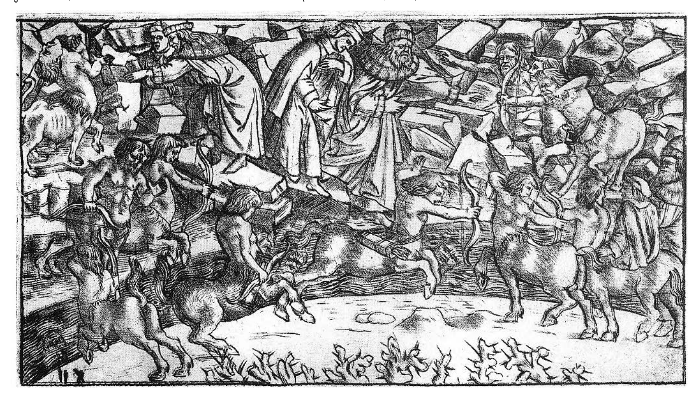
Figure 2. Inferno, Canto XII: The Punishments of the Murderers. 9.7 x 17.4 cm. (Photo: British Museum, London).

font, illustrations, disposition of text and images on the page, and inclusion of other texts to accompany the main work. The final element was the creative act of interpretation that appropriated the work in reading, so that a reader's understanding of a text was dependent on its content and presentation, but also on his or her imaginative reconstruction of the work through the deciphering of its visual and textual codes. This interpretation was obviously personal, but it is also true that any individual reader necessarily belonged to one or more "interpretive communities," that is groups of readers who shared the same reading styles and strategies of interpretation.<sup>29</sup>