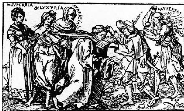
FIGURE 3. Sebald Beham. Allegory auf das Mönchtum , 1521, single-leaf woodcut (Photo: Munich, Staatliche Grapische Sammlungen).