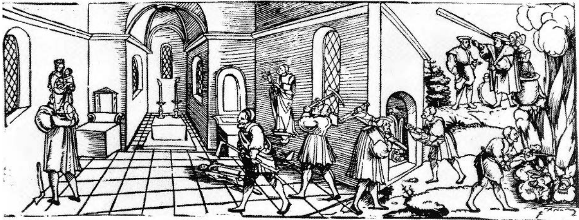
FIGURE 8. Erhard Schön. Klagrede der armen verfolgten Götzen und Tempelpilder , ca. 1530, broadsheet.