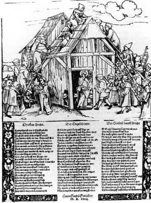
FIGURE 5. Erhard Schön. Das Hauss des Weysen vnd das haus des vnweisen manns , 1524, broadsheet.