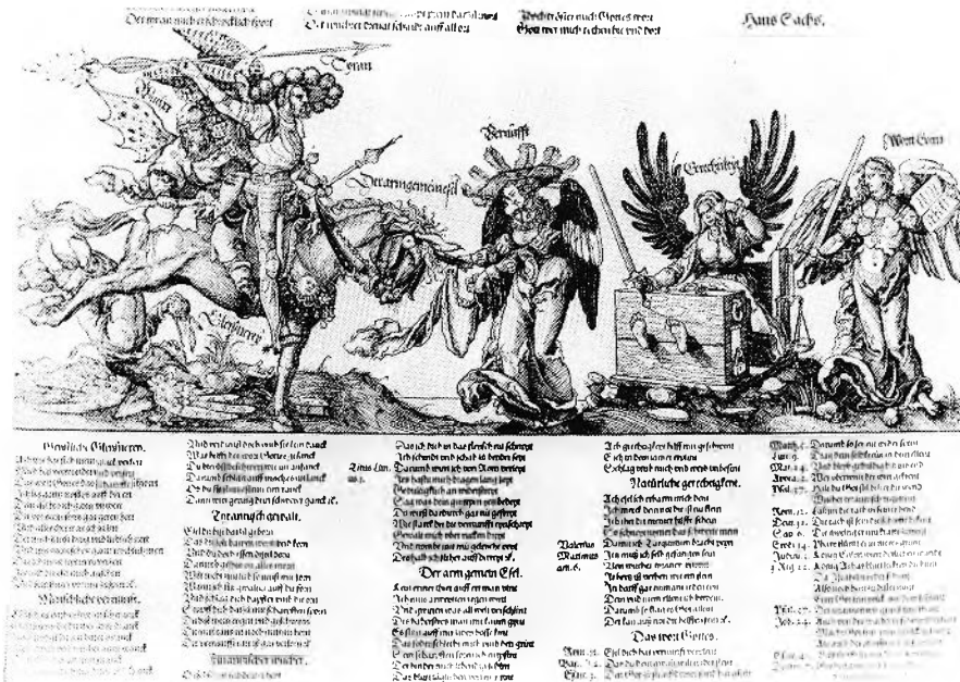
FIGURE 10. Peter Flötner. Tyrannei, Wucher und Gleisnerei , 1525.