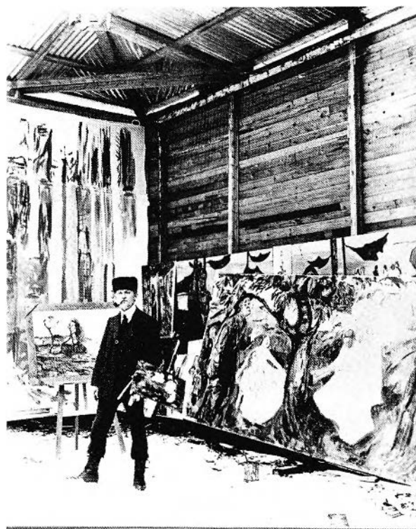
FIGURE 25. Edvard Munch in his outdoor studio at Ekely.