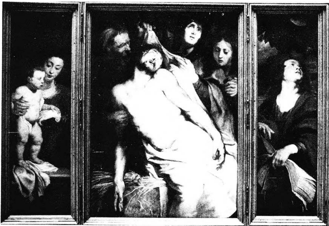
FIGURE 16. P. P. Rubens, Lamentation , 1614. Antwerp, Royal Museum.