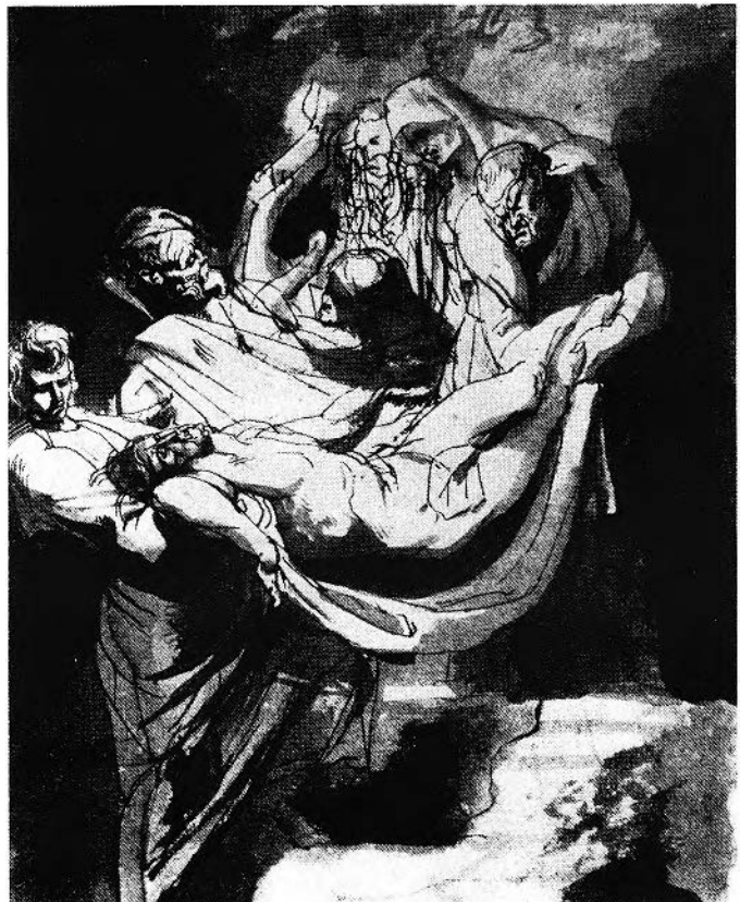
FIGURE 20. P. P. Rubens, Entombment , 1612-13. Drawing. Amsterdam, Print Room (Photo: reproduced from J. Held, Rubens, Selected Drawings , II [London, 1959]).