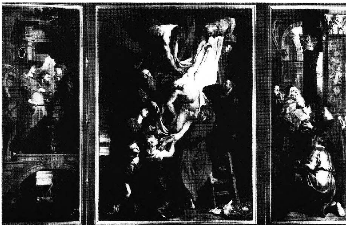
FIGURE 18. P. P. Rubens, Descent from the Cross , 1612-14. Antwerp, Cathedral of Our Lady (Photo: reproduced from F. Beaudouin, Rubens et son Siècle [Antwerp, 1972]).