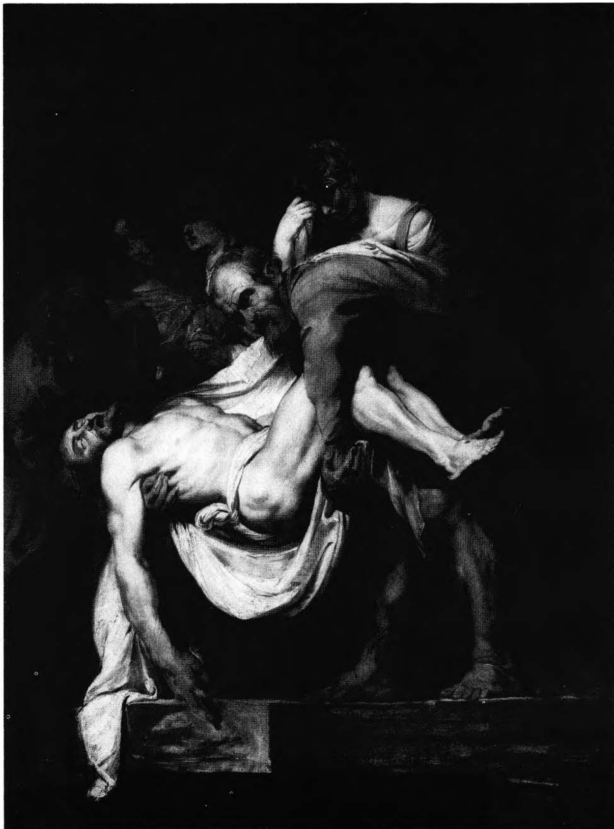
FIGURE 13. P. P. Rubens, Entombment , 1611-13. Ottawa, National Gallery.