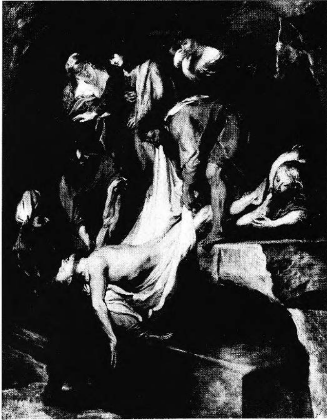
FIGURE 19. P. P. Rubens, Entombment , ca. 1615. London, Coll. Count Seilern (Photo: reproduced from J. Held, The Oil Sketches of Peter Paul Rubens , I [Princeton, 1980]).