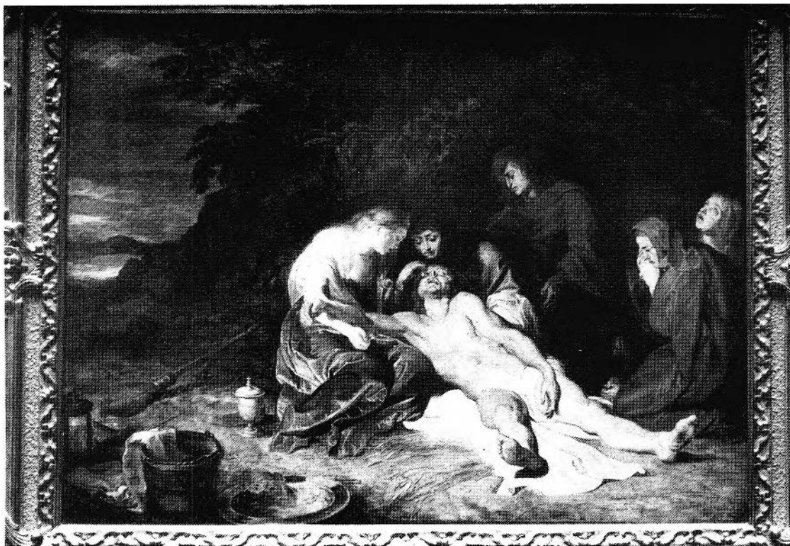
FIGURE 17. P. P. Rubens, Christ à la Paille , 1617-18. Antwerp, Royal Museum (Photo: reproduced from F. Beaudouin, Rubens et son Siècle [Antwerp, 1972]).