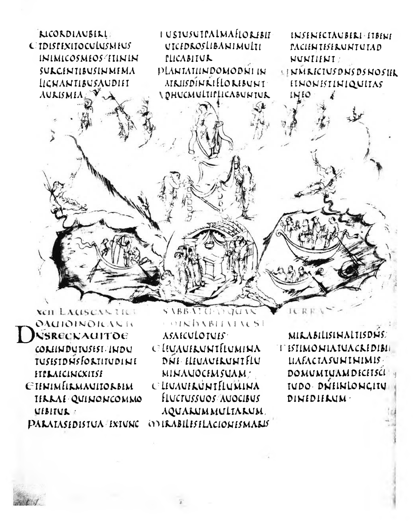
FIGURE 2. The Utrecht Psalter, illustration to Psalm 92.