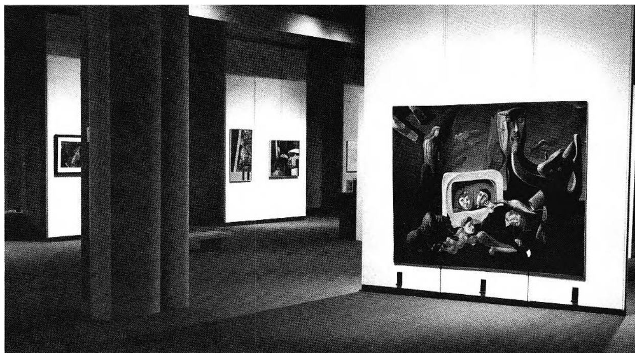
FIGURE 1. Installation view of Le surréalisme portugais , Galerie UQAM, Montréal. To the right, painting by A. Dacosta, cat. 35 (Photo: Luis de Moura Sobral).

The catalogue is arranged as a series of monographic studies on 20 artists, with all the works of the exhibition being reproduced in black-and-white. There also is an