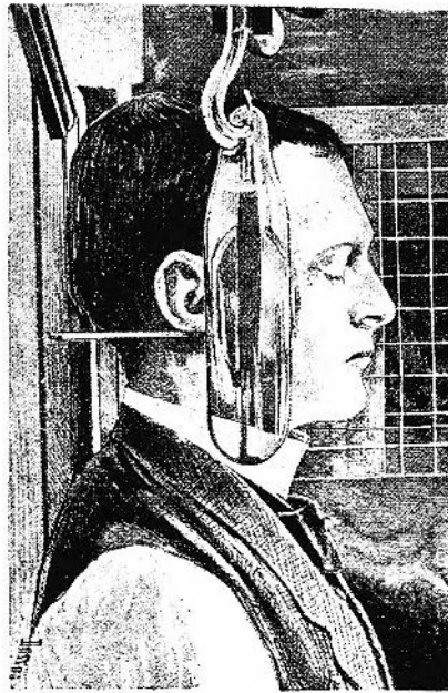
Adormeci certamente por intervenção da misteriosa ampola que descia do teto...