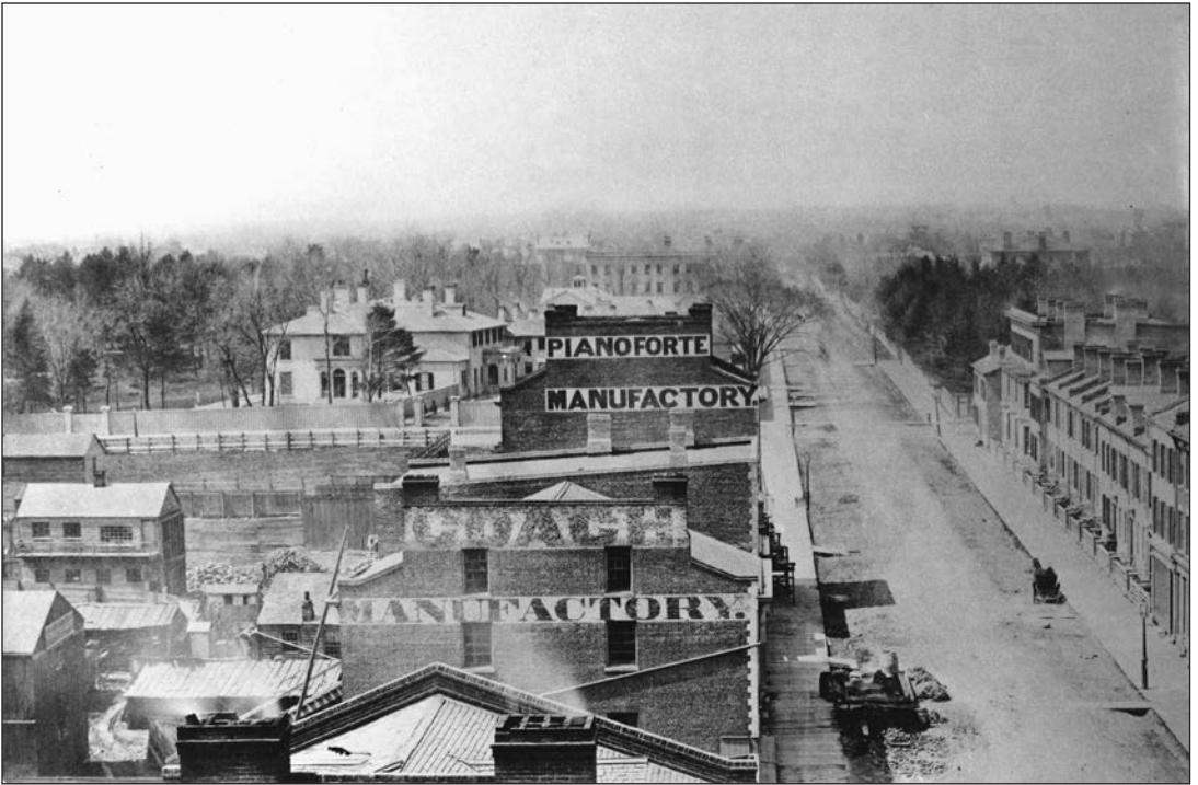
Toronto from the top of the Rossin House Hotel, looking west along King Street West in 1856. Note the Pianoforte "Manufactory" and Coach "Manufactory." The language is significant as historically "manufacture" preceded mechanized factories by several decades (Marx, 1887; Blumin, 1976). It was a transitional form in which large numbers of craftsmen were organized to work together in sequence or to do the same kind of work (making needles, etc.). According to Blumin, a large number of workers appeared before the advent of factories. In some ways, they were craftsmen, but in a state of degradation. (City of Toronto Archives, fonds 1498, item 13).

There can be little doubt that by the 1880s much work formerly conducted in small workshops was undertaken in factories. The important change was an increase in the size of the workplace. In 1870, thirty-eight per cent of Toronto's industrial work force was employed in factories of over a hundred workers. Another twenty-one per cent worked with between fifty and ninety-nine other employees, and eleven per cent worked in shops with between thirty and forty-nine other employees. 41 In