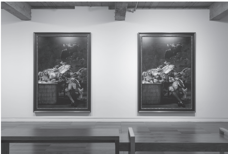
Vue de l'exposition Yinka Shonibare MBE: Pièces de résistance , 2015, DHC/ART Fondation pour l'art contemporain, Montréal. De gauche à droite: The Sleep of Reason Produces Monsters (America) , 2008; The Sleep of Reason Produces Monsters (Australia) , 2008. Photo: Richard-Max Tremblay.

View of Yinka Shonibare MBE: Pièces de résistance , 2015, DHC/ART Foundation for Contemporary Art, Montreal. Left to right: The Sleep of Reason Produces Monsters (America) , 2008; The Sleep of Reason Produces Monsters (Australia) , 2008. Photo: Richard-Max Tremblay.