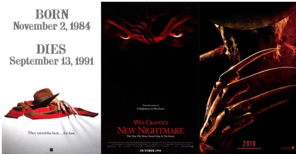
Figure 5. Promotional posters teasing Freddy's death, resurrection, and reinvention (New Line Cinema 1991; 1994; 2010)