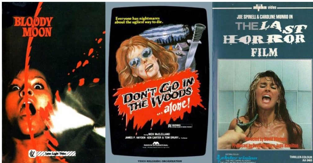
Figure 2. Faceless killers across UK home video releases for Bloody Moon , Don't Go in the Woods... Alone! , and The Last Horror Film