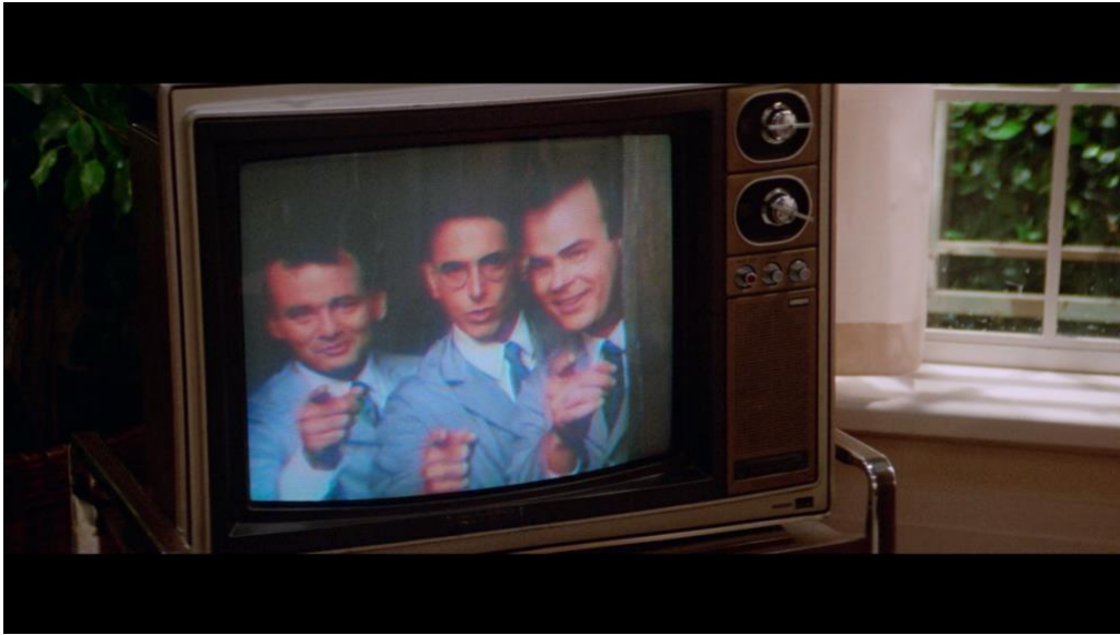
Figure 1. The newly branded Ghostbusters address the in-narrative audience through TV advertising (Reitman 1984)