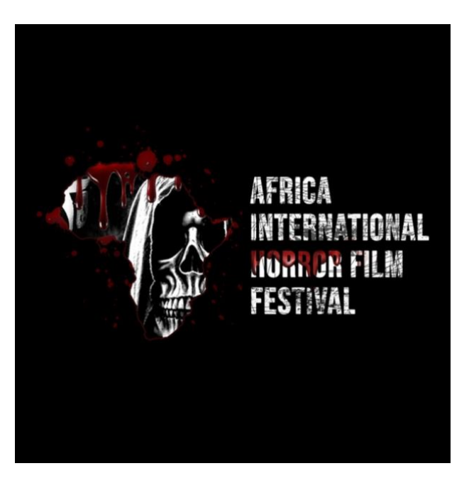
Figure 2: Africa International Horror Film Festival's Official Logo

We also aim to reawaken the consciousness among African filmmakers and industry stakeholders on the need to explore other forms of storytelling deeply rooted in African culture and tradition.